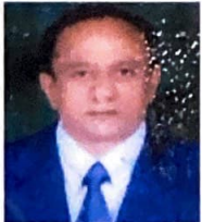
Jnana Sahyadri - Shankaraghatta

ವಿಶ್ವವಿದ್ಯಾಲಯದ ಮೊಹರಿನೊಂದಿಗೆ ನೀಡಲಾಗಿದೆ. Given under the seal of the University.