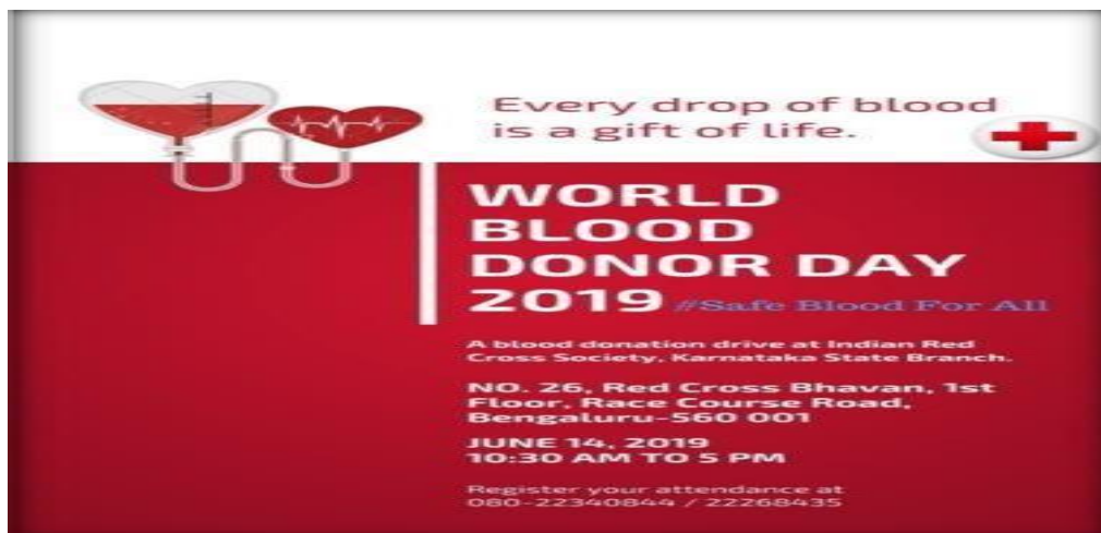
Figure 1: Poster on “WORLD BLOOD DONOR DAY 2019”

The delegation was warmly welcomed by the IRCS officials, who provided an insightful overview of the organization's history, mission, and ongoing initiatives. The visit began with a tour of the IRCS facilities, where the students and officers observed various departments, including blood donation centers, disaster response units, and community health programs.