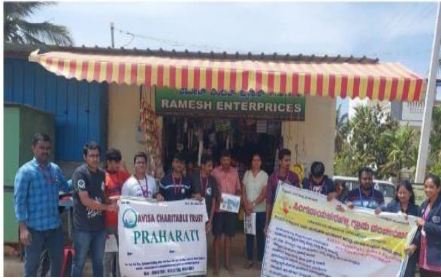
Students giving awareness on Plastic Pollution