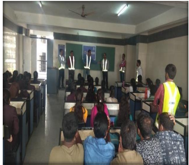
Figure 3 and 4: Tata Group Employees Discussing Tree Maintenance and Environmental Impact.

Tree-Planting Ceremony: To promote environmental sustainability, a tree-planting ceremony was held, where students planted saplings around the campus.