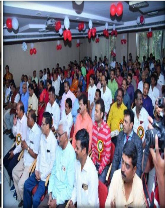
Figure 2 and 3: Interactive Session with IRCS Officials on Humanitarian Efforts.