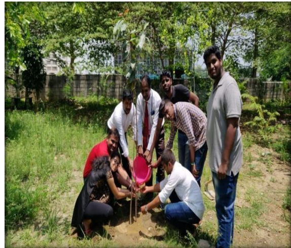
Figure 1 and 2: Students and staff participate in the planting saplings drive on World Environment Day.

The World Environment Day celebration at City Engineering College was a successful event that highlighted the significance of environmental protection. The activities organized not only educated participants but also inspired them to adopt sustainable practices, contributing to a greener and healthier planet.