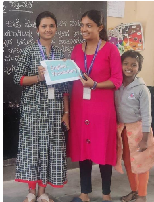
Volunteers teaching English Vocabulary to Students