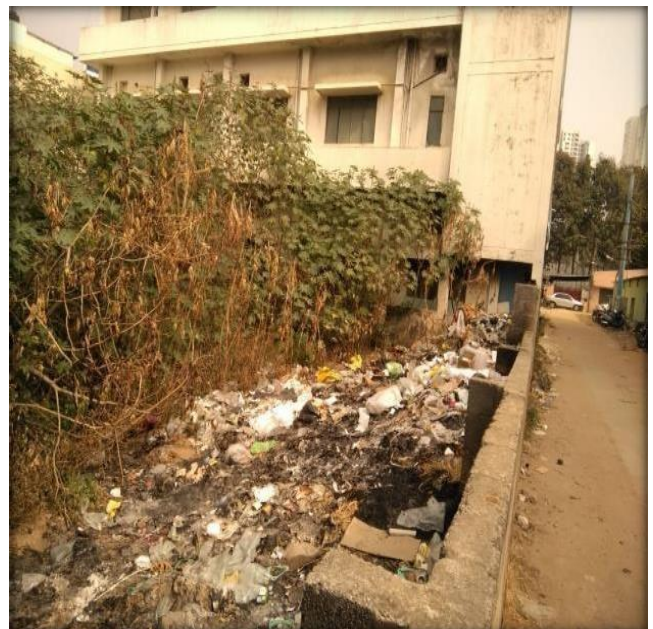
Figure 3 and 4: Volunteers documenting areas with improper waste disposal for BBMP's attention.