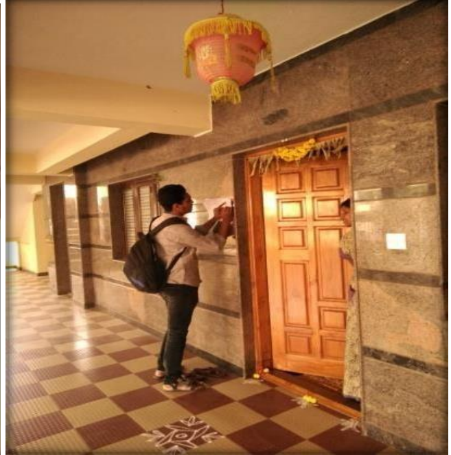
Figure 1 and 2: Volunteers engaging with residents to spread awareness about proper waste disposal.