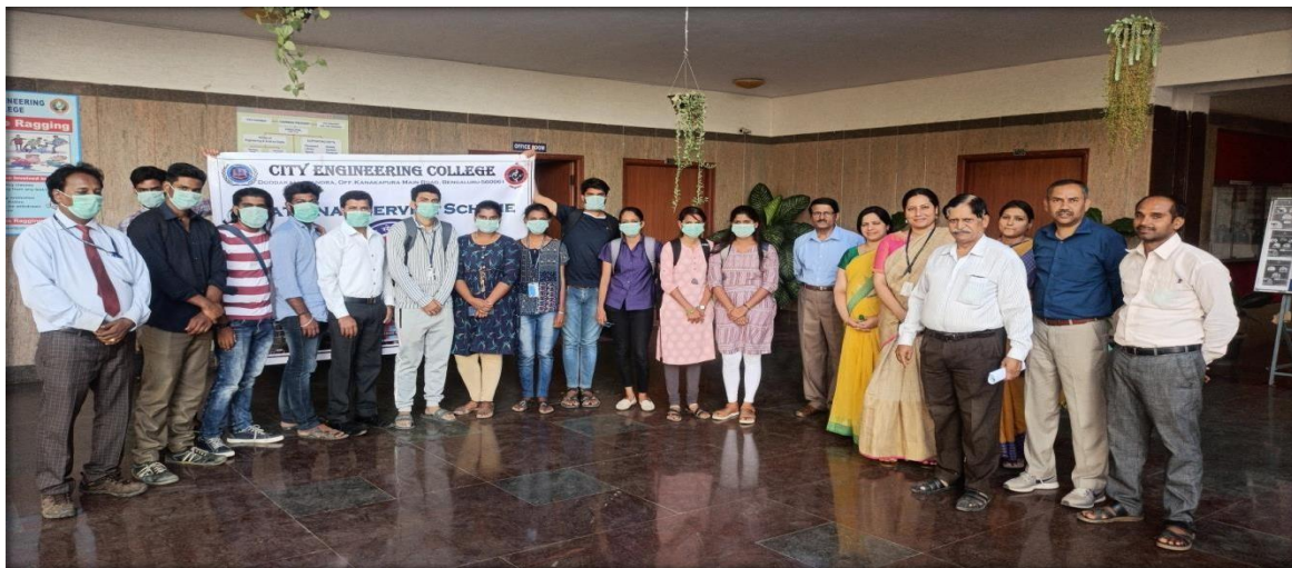
Figure 2,3 and 4: Glimpse of distributing masks to students and staffs.