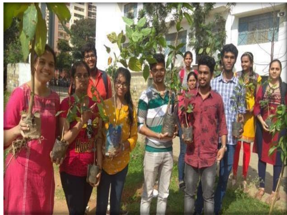
Figure 5 and 6: Students Planting Saplings to Enhance Campus Greenery