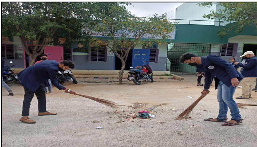
Figure 1: Students and volunteers working together to keep school clean and green

By emphasizing cleanliness in schools, the drive contributed to broader goals of the Swachh Bharat Mission, enhancing student health, community well-being, and environmental conservation.