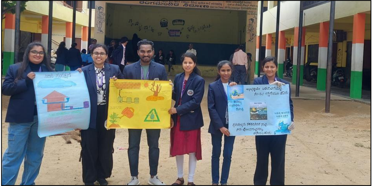
Fig2. CEC Students team at Government School, Doddakallasandra