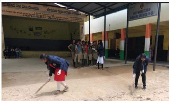
Students cleaning the school premises