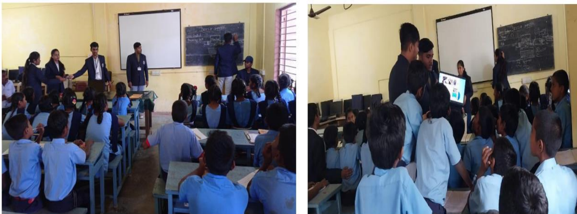
Volunteers teaching Basic Computer Skills to Students

The initiative by engineering students to teach basic computer skills to government school children was a successful effort in bridging the digital divide. The project not only equipped students with valuable skills but also fostered a sense of community involvement and responsibility among the volunteers.