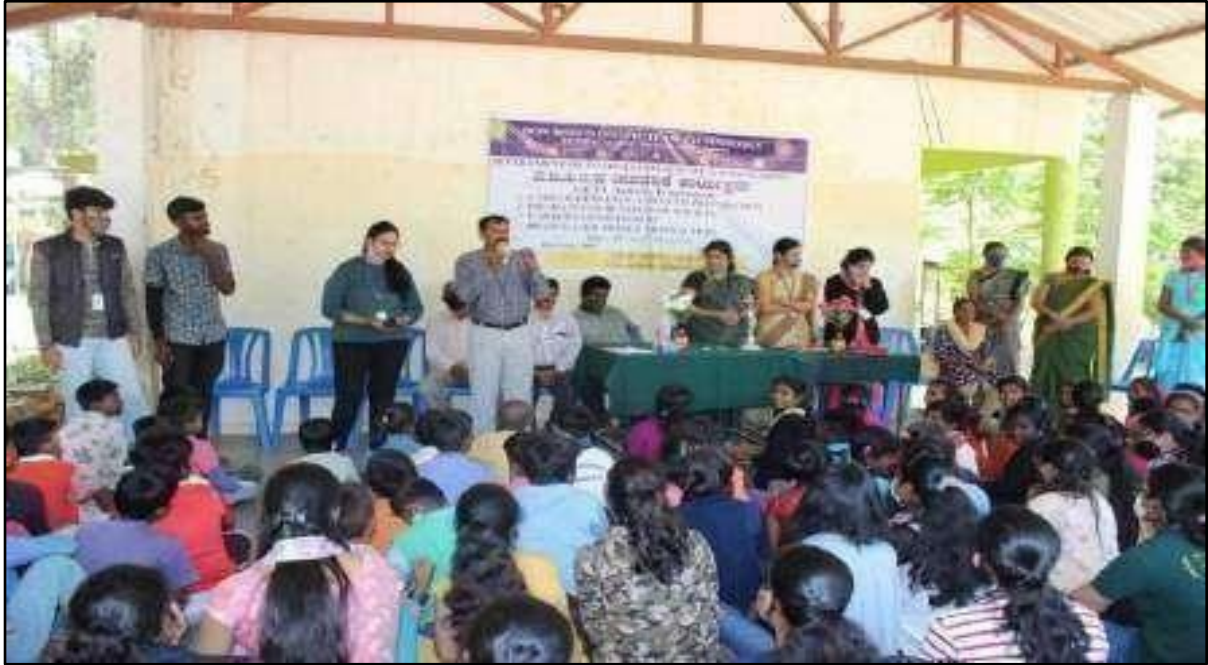
Figure 1: Avisa Charitable Trust members and Volunteers engaging with the community, discussing the importance of hygiene and sanitation practices.