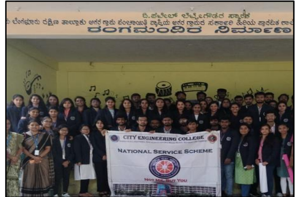
Figure: CEC students briefing about Water awareness to school kids at Govt school, Agara