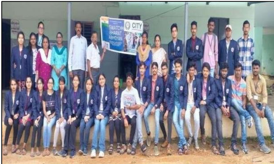
Figure 3: Celebrating our successful Swachh Bharat drive with a group photo