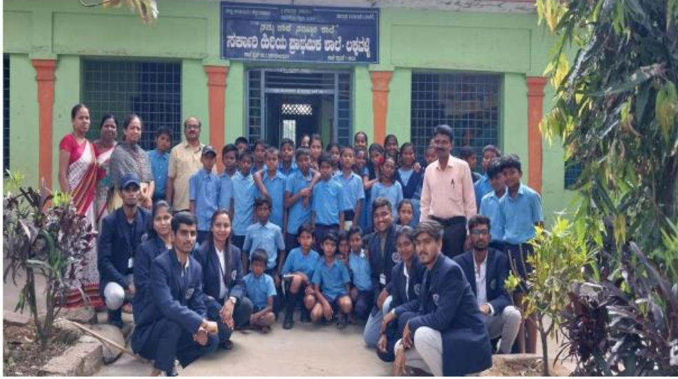
Volunteers with students