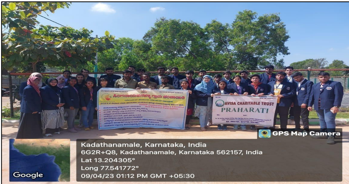
Figure 2: Students and Avisa Charitable Trust members posing together, celebrating the success of the rural development program.