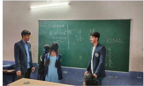
Students teaching the tricks