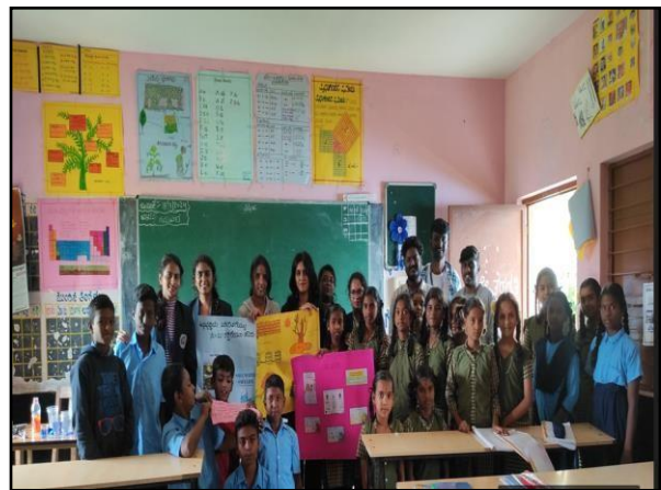
Fig. Students involved in the waste management campaign