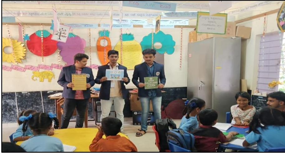
Figure 2: Teaching the next generation about the importance of cleanliness and responsibility.