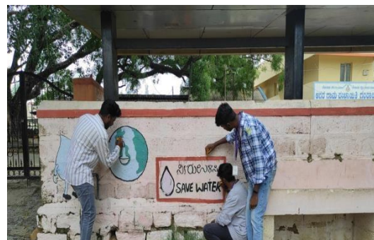
Students painting the walls of the school