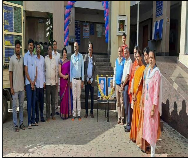
Fig. Flag hoisting for the Republic Day celebration at CEC.