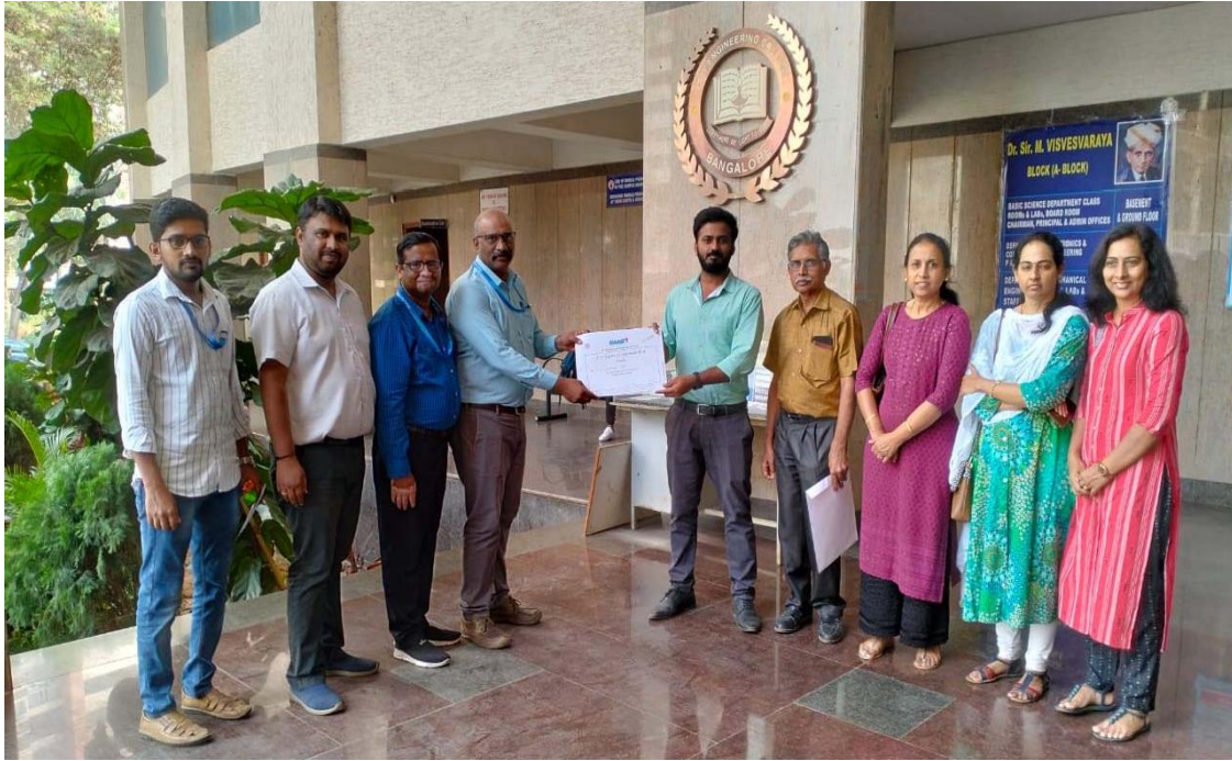
Figure 5: A token of appreciation for the Rotary Club Kanakapura Road and BMST team