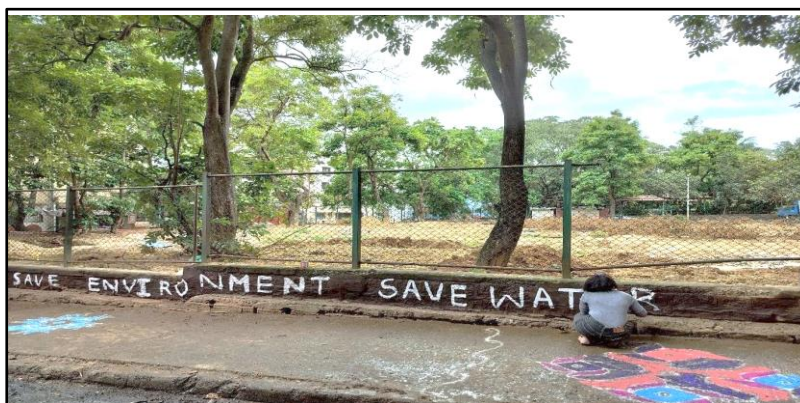
Figure 1: Transforming public spaces: Students actively participating in road cleaning.

This initiative was greatly supported by the enthusiastic participation of volunteer students from City Engineering College. Their active involvement included not only performing the cleaning tasks but also leading educational efforts on proper waste segregation. The students organized interactive sessions to raise awareness about the importance of maintaining cleanliness and aligned with the Swachh Bharat Mission's green initiative. Their dedication helped in enlightening the local community, fostering a sense of responsibility, and encouraging residents to adopt sustainable waste management practices. The initiative significantly improved the cleanliness of the area and demonstrated the positive impact of student involvement in community service and environmental stewardship.