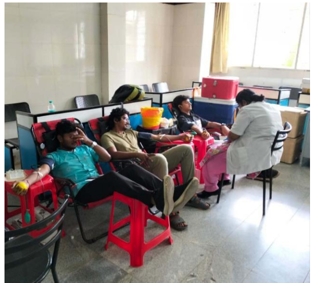
Figure 2 and 3: Every donation counts – our students show their commitment to helping others by donating blood.