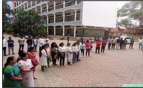
Figure 2: Independence Day celebration at CEC Campus

The celebration concluded with a vote of thanks by the NSS Club Coordinator, who expressed gratitude to all those who contributed to the event's success. The Independence Day celebration at City Engineering College was a resounding success, leaving everyone with a renewed sense of patriotism and commitment to the nation's future.