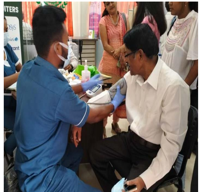
Figure 4 and 5: Health is wealth – providing free checkups and consultations to our college staffs and students.