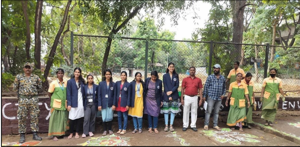
Figure 2: Students raise awareness with impactful environmental messages on community wall