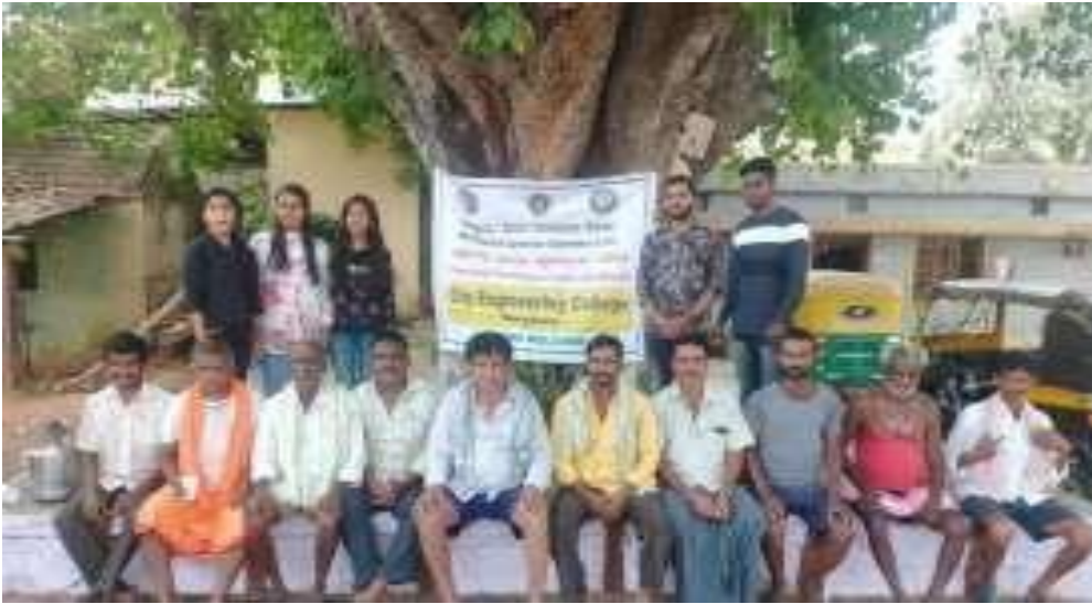
Figure 2: Representatives from K.Gollahalli Grama Panchayath and local authorities showing their support for the campaign

Community Engagement: The initiative received strong support from K.Gollahalli Grama Panchayath and local residents. Refreshments were provided to attendees, fostering a collaborative atmosphere. The involvement of local authorities and the institute's head was crucial in ensuring the event's success.