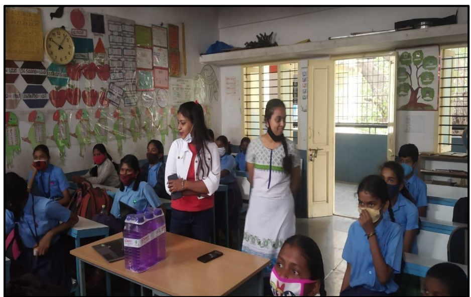
Fig Students listening to Introductory class