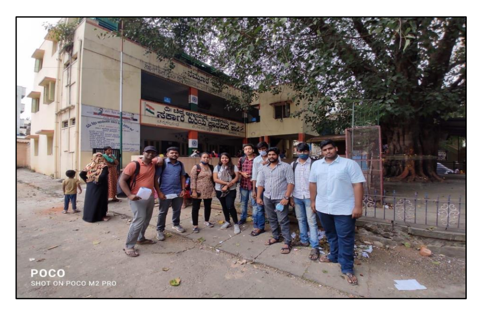
Fig. CEC students participated in the campaign

9. Activity Name: Empowering Young Minds at G.H.P.S, Chikkakallasandra Venue: G.H.P.S, Chikkakallasandra Date: 2<sup>nd</sup> November 2021 to November 6<sup>th</sup> 2021