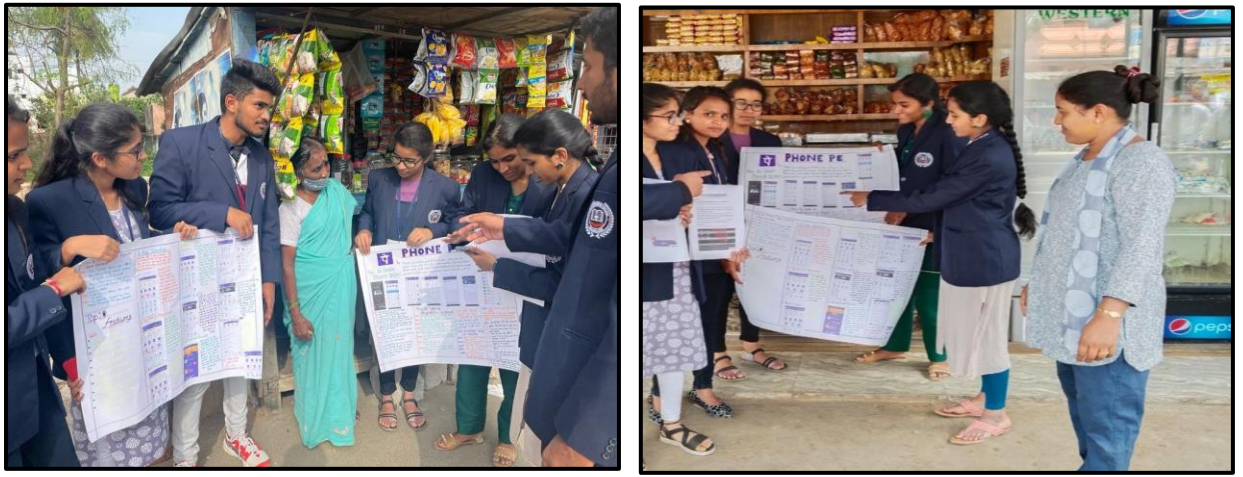
Figure: Students demonstrating how to use popular digital payment apps like Google Pay and PhonePe

Venue: Thoppaganahalli Date: August 25, 2021