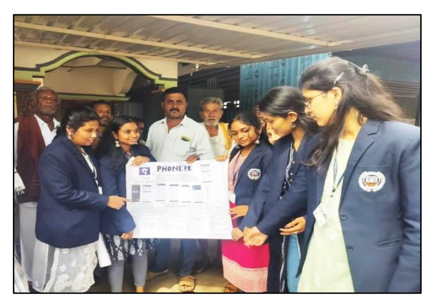
Figure 1 and 2: Students explaining digital transaction benefits to Kodihalli residents.