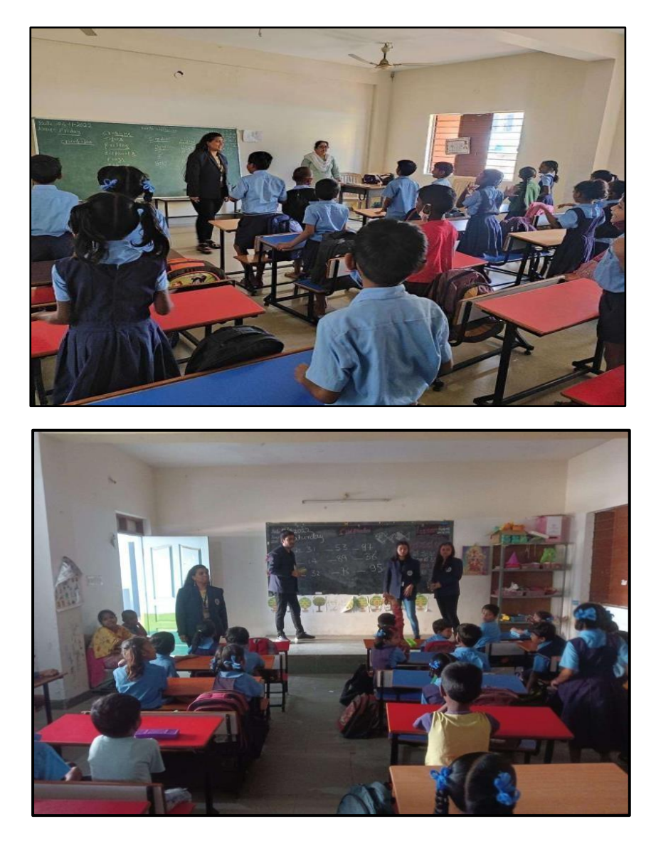
Figure 1 and 2: Engaging young learners with interactive lessons