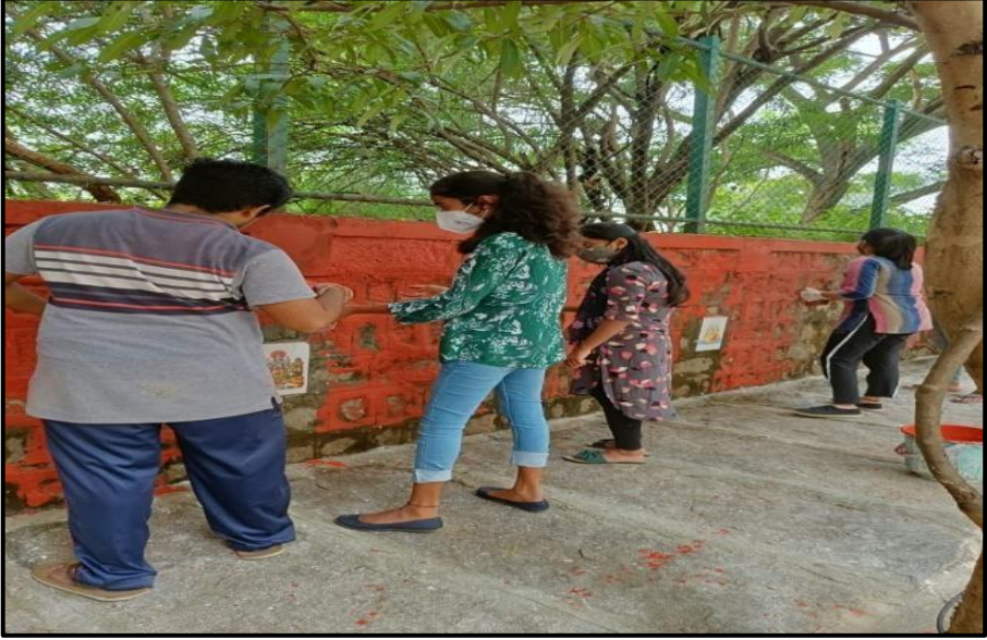
Volunteers adding vibrant and informative drawings to local walls to promote cleanliness and environmental awareness.