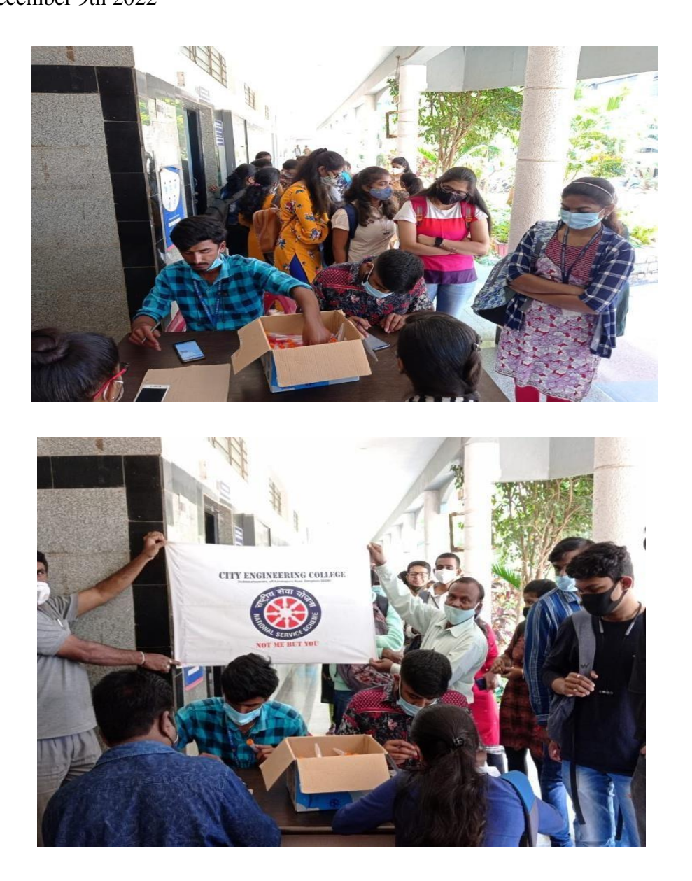
Figure 1 and 2: NSS volunteers and medical staff working together to conduct the COVID-19 tests efficiently.

Venue: CEC Campus Date: December 9th 2022