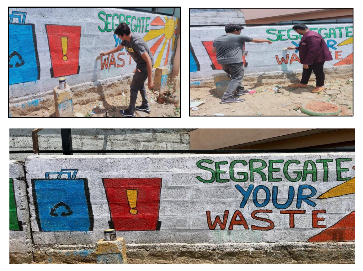
Figure: Before and after—witness the transformation of the school premises through the students' hard work.

Venue: Govt. School, Deepanahalli Date: 23/09/2021