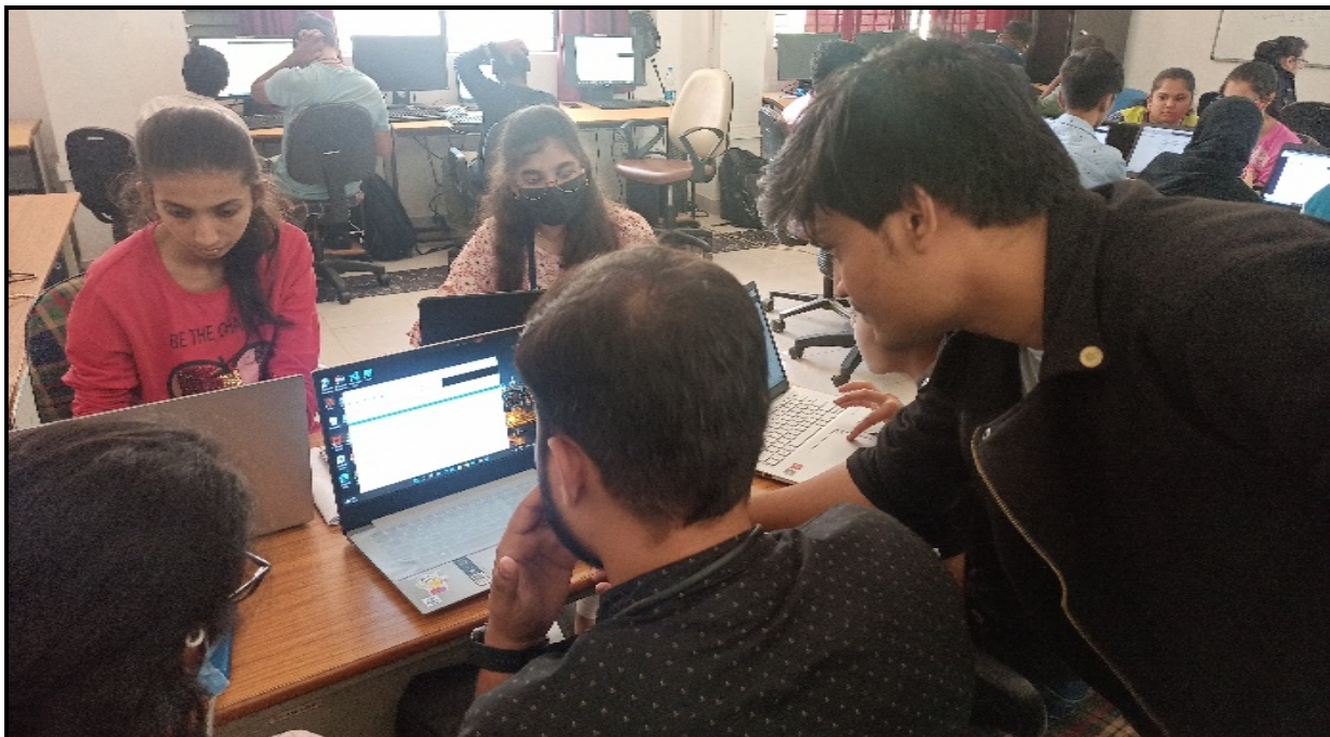
FIG 1: Participation of Students in event "Coding in C"

By the conclusion of "Coding with C," participants will have gained a foundational knowledge of C programming and developed the confidence to tackle basic coding challenges. They will be able to understand and write C code with greater proficiency, troubleshoot and debug issues, and appreciate the practical applications of C in various fields. Additionally, participants will leave with resources and a clearer pathway for further study, empowering them to continue their programming journey and explore more advanced topics in C and beyond.