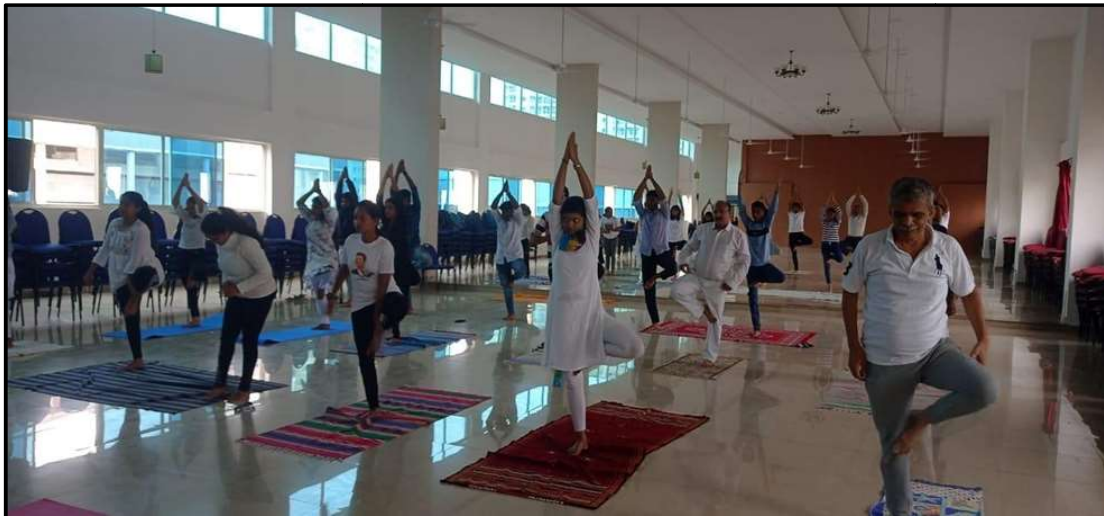
FIG 2: Participation of students in “International Day of Yoga”