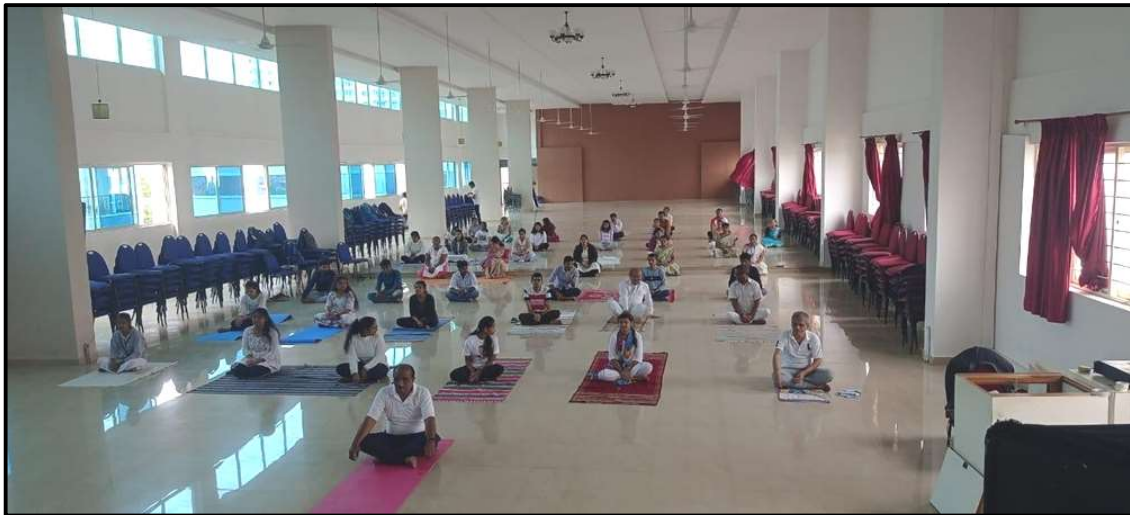
FIG 1: Participation of students in “International Day of Yoga”

less physical activity. Additionally, the accessibility of online classes and virtual communities allowed people to maintain social connections and support networks, enhancing feelings of belonging and reducing feelings of isolation. Overall, yoga proved to be a valuable tool for promoting holistic health and maintaining balance during a challenging period.