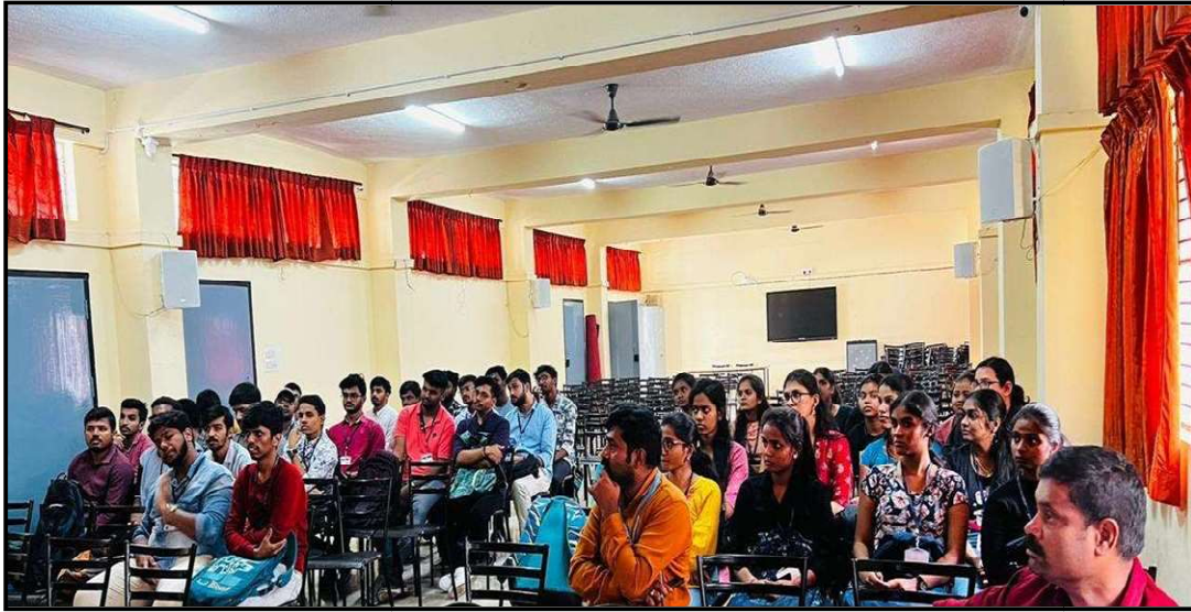
FIG 2: Participation of students in workshop