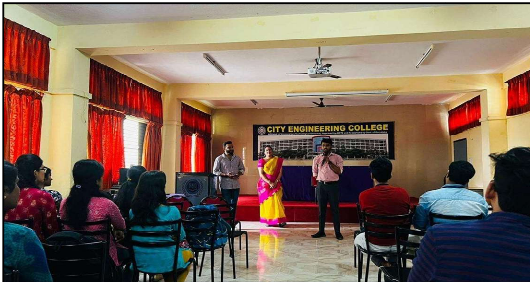
FIG 1: Resource person explaining about the French language and its implications for jobs in abroad.