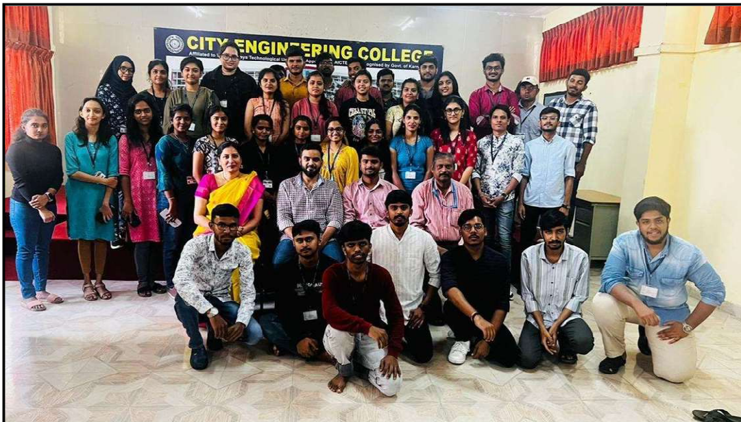
FIG 3: Concluding the workshop with a group photo