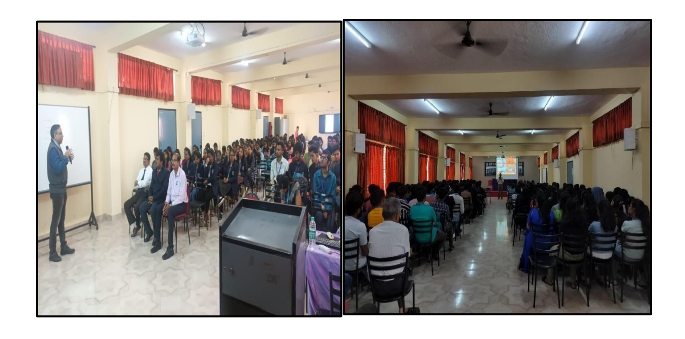
FIG 1,2 Resource Person Addressing the Session