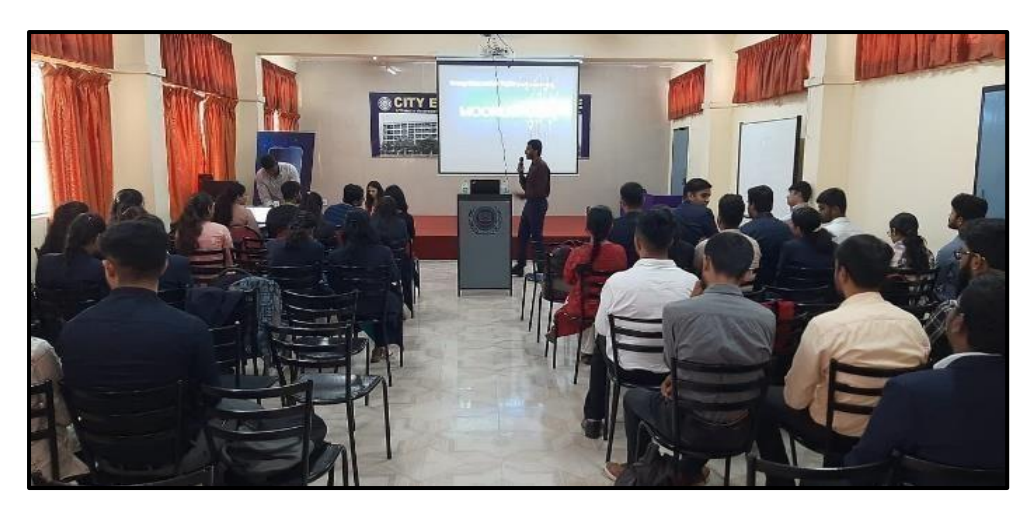
FIG 1 Resource Person Addressing the Session