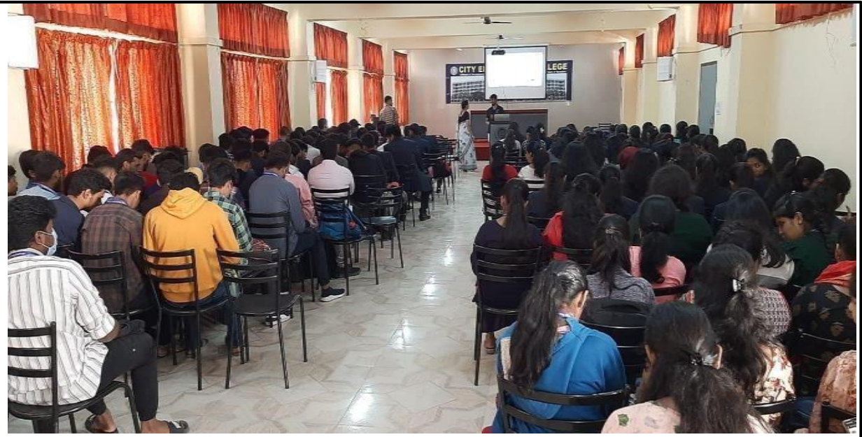
FIG 1 Resource Person Addressing the Session