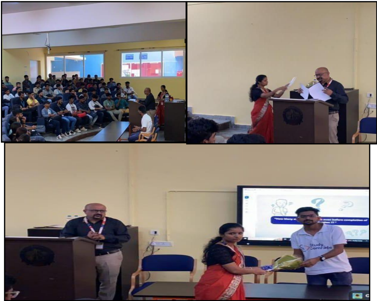
FIG 1: Resource Person Addressing the Session