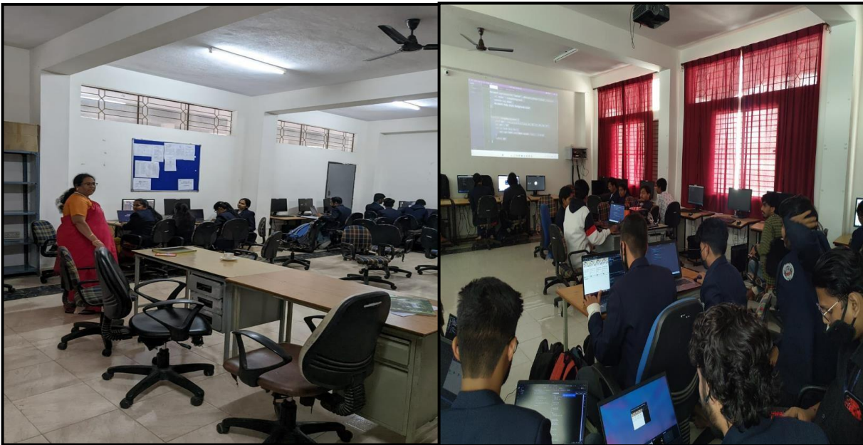
FIG 2: Handson Session on the topic