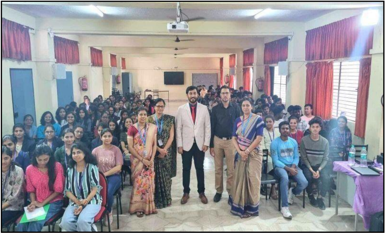
FIG 2 Group photo with student and Faculty