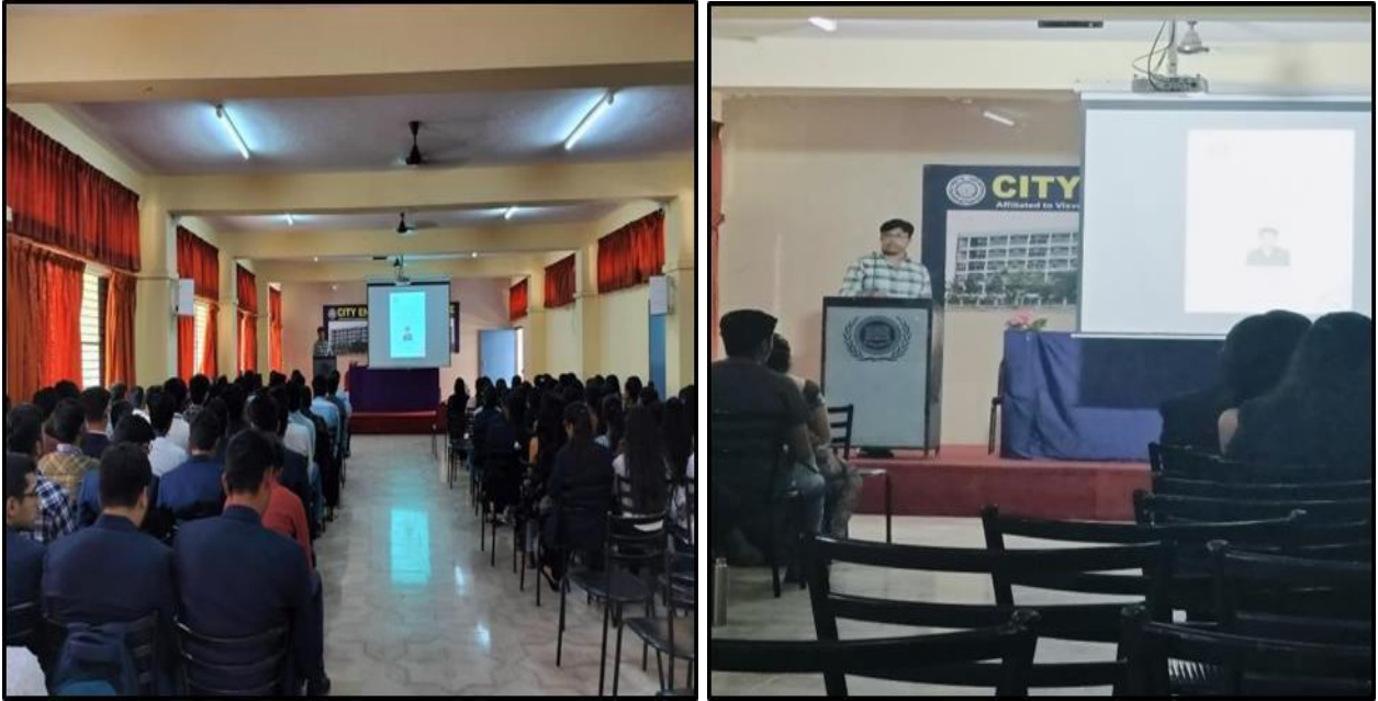
FIG 2: Students Participation in the workshop

ATTESTED COPY skan PRINCIPAL CITY ENGINEERING COLLEGE Kanakapura Main Road, Bangalore-560061