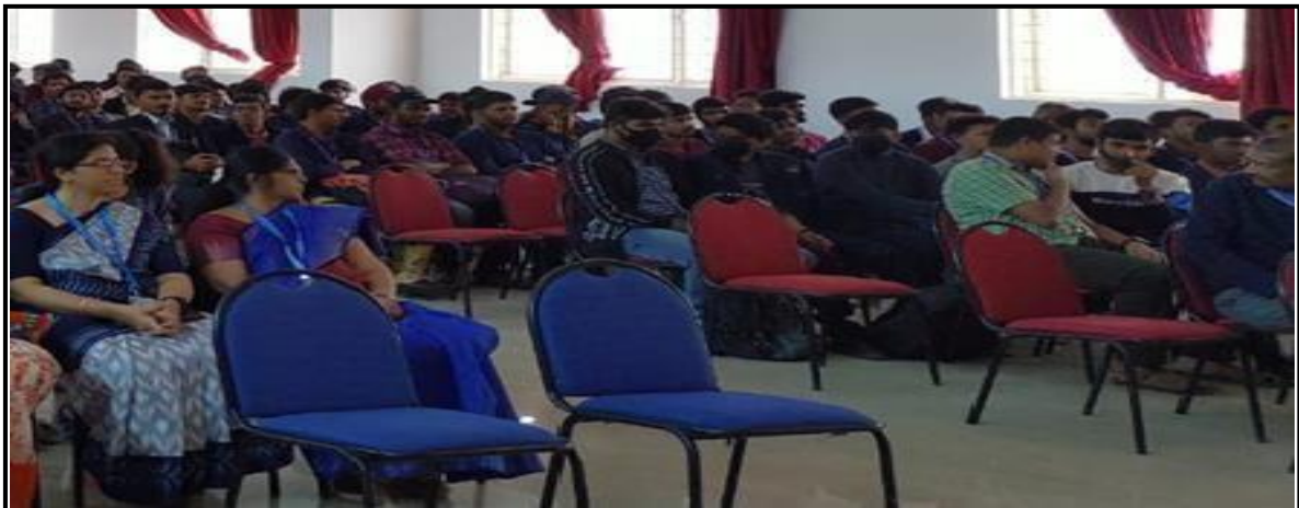
FIG 2,3: Students Participation in the workshop