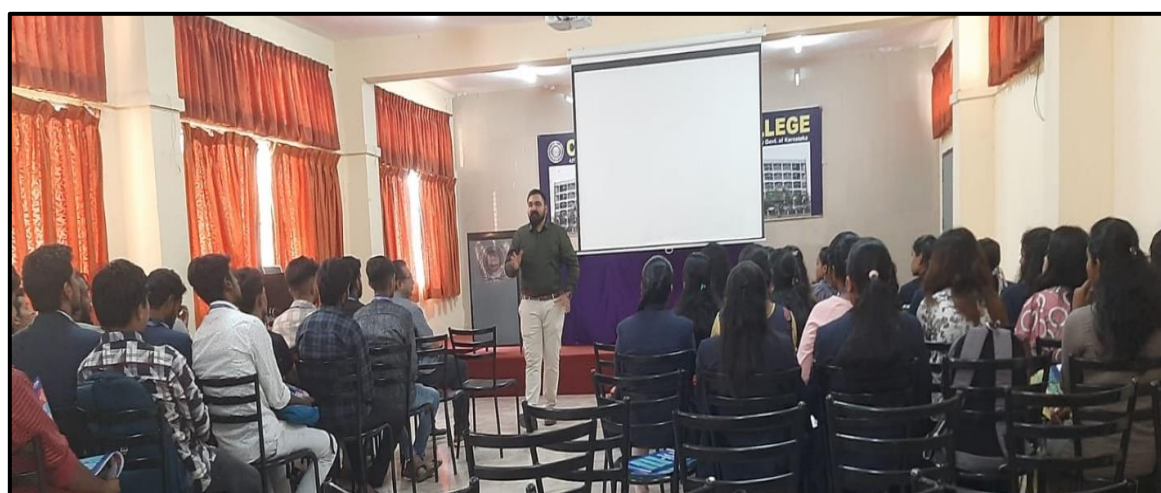
FIG 1: Students Participation in the Training