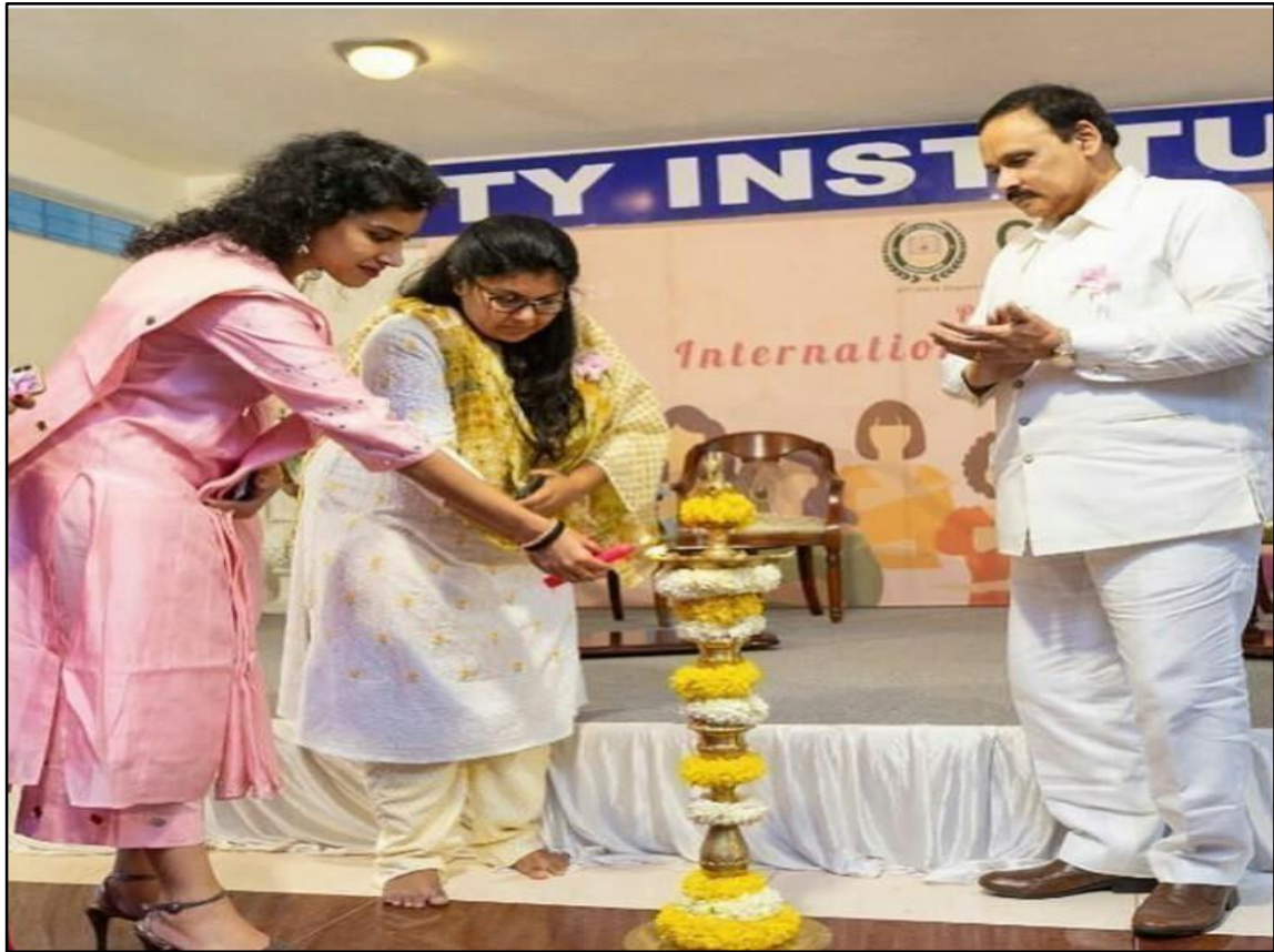
Fig2: Lighting the Lamp