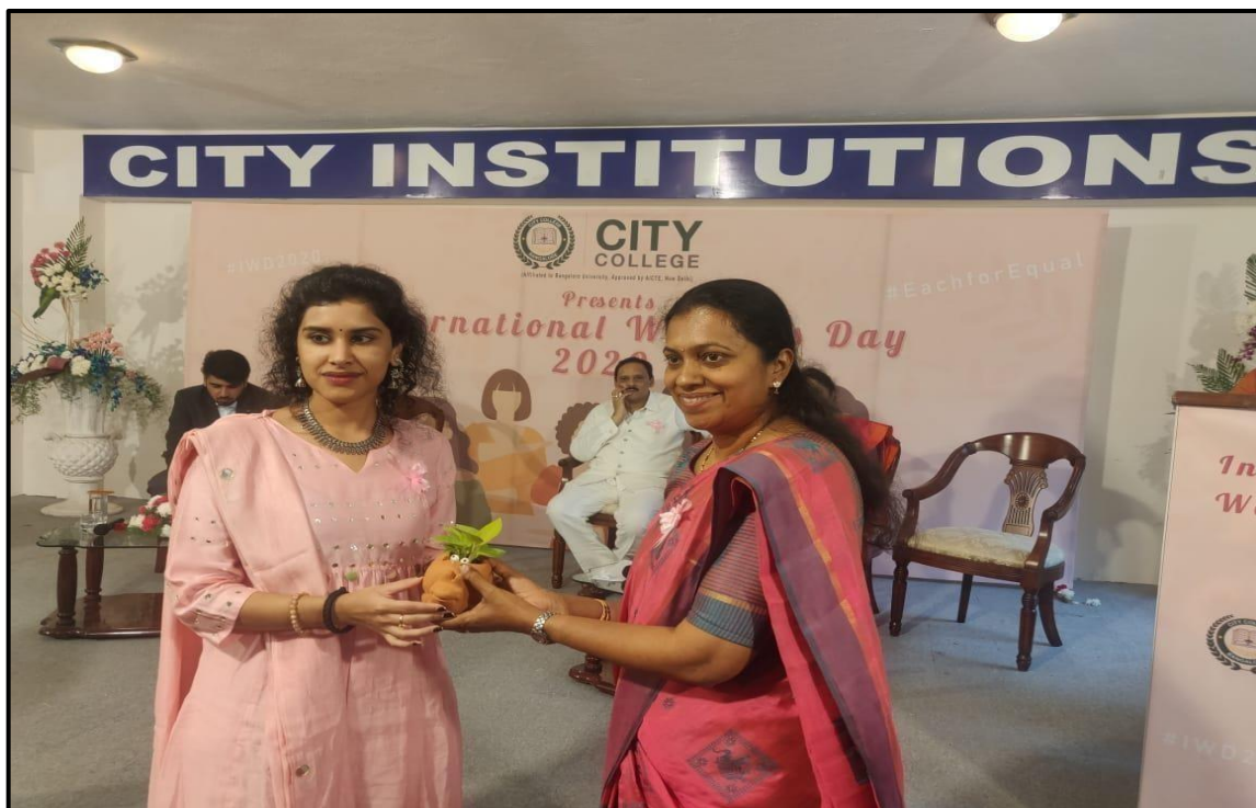
Fig 3: Presenting of Plant Samplings