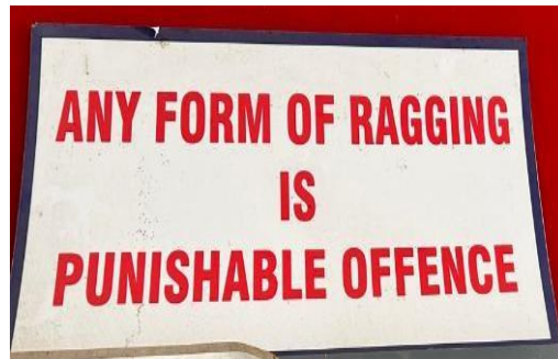
FIG 1: Awareness of Anti-ragging display poster in Main Block