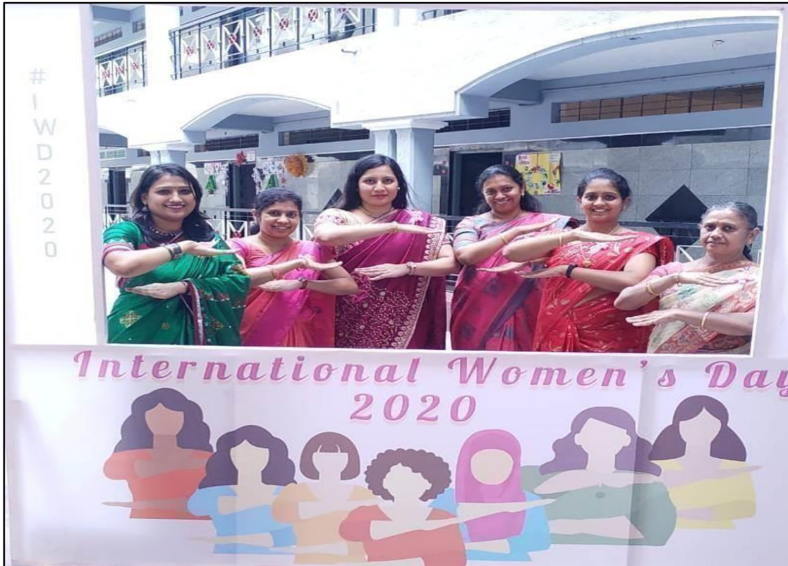
Fig 4: Glimpses of Women's Day