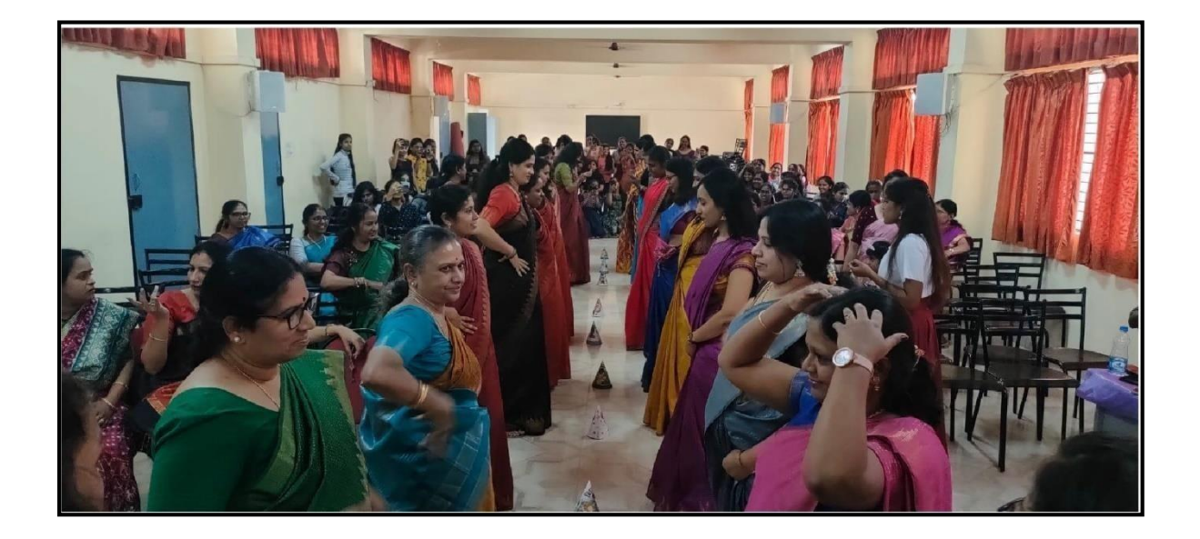
Fig 2: Faculties playing the games organised by students