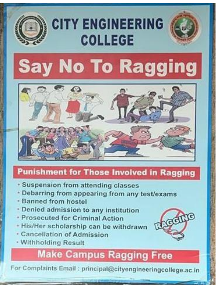
FIG 2: Awareness of Anti-ragging display poster in CS Block