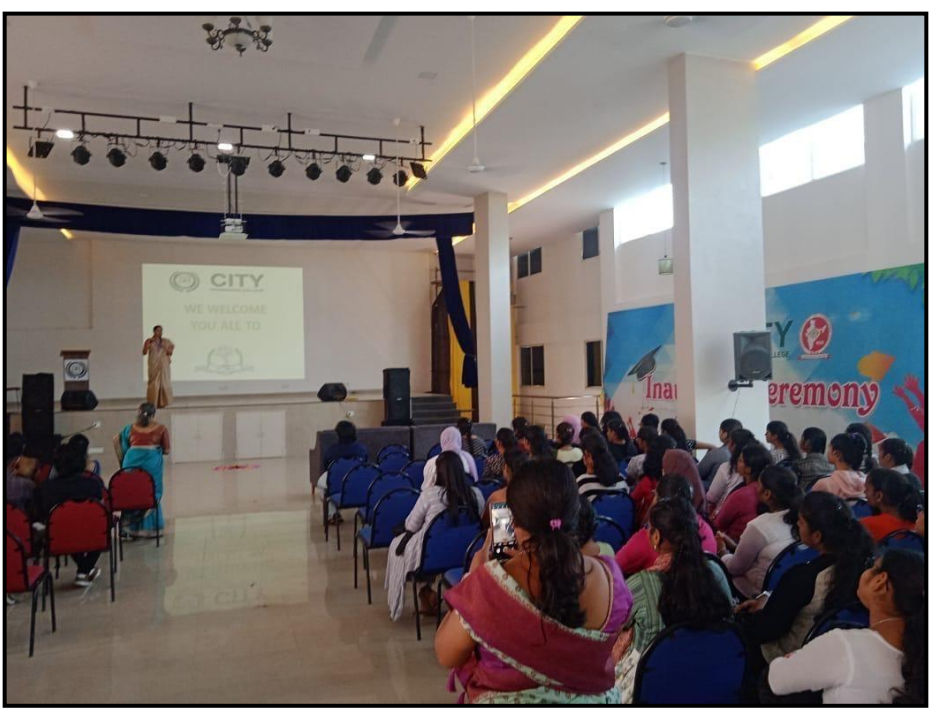
Fig 1: Awareness program on Anti ragging