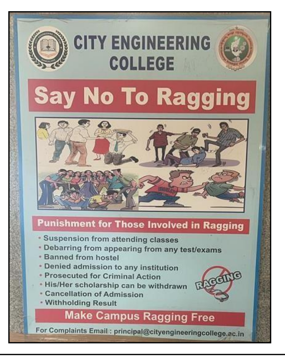
FIG 1: Awareness of Anti-ragging display poster in Main Block

For the benefit of first year students, anti-ragging awareness display posters were displayed in common places of academic blocks and entrance of all the departments of the college.