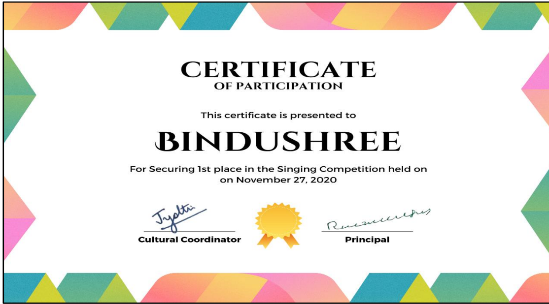
Fig. 4 Student of 3rd Sem Bindushree won 1st prize in Singing Competition

Singing Competition was held through online mode for the students to exhibit their talents held on 27 Nov 2020.