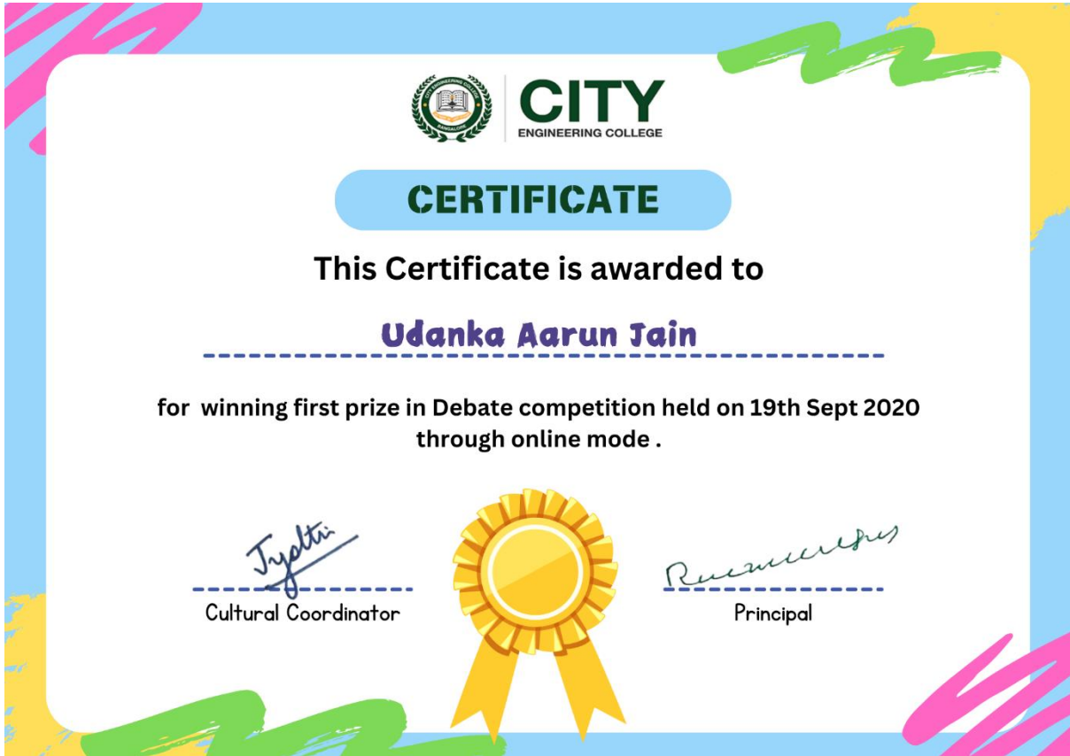
Fig.2 Student of 4 th semester Udanka Jain secured 1 st place in Debate Competition