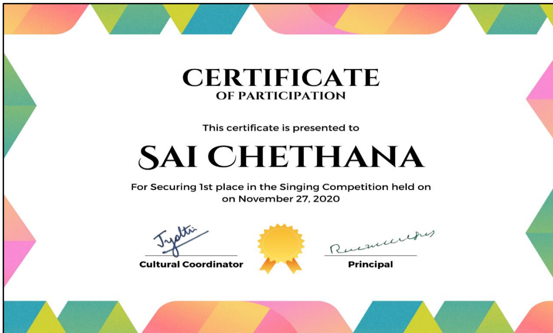
Fig. 5 Student of 3rd Sem Sai Chetana won 1st prize in Singing Competition