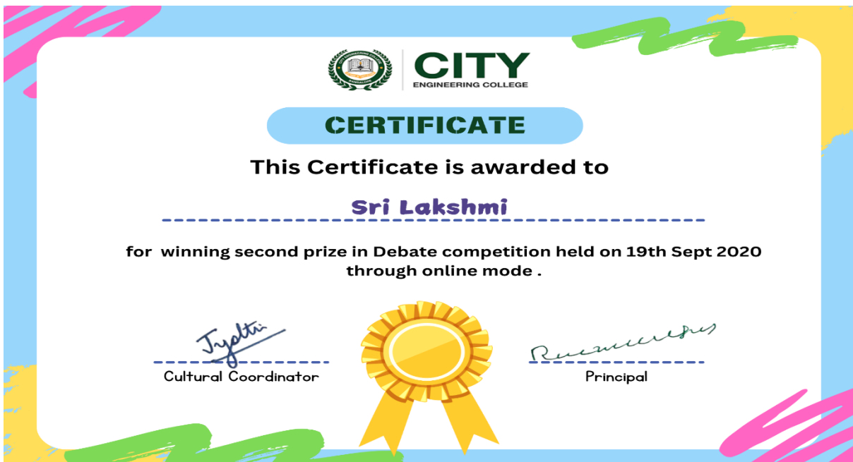
Fig. 3 Student of 4 th semester Sri Lakshmi secured 2 nd place in Debate Competition