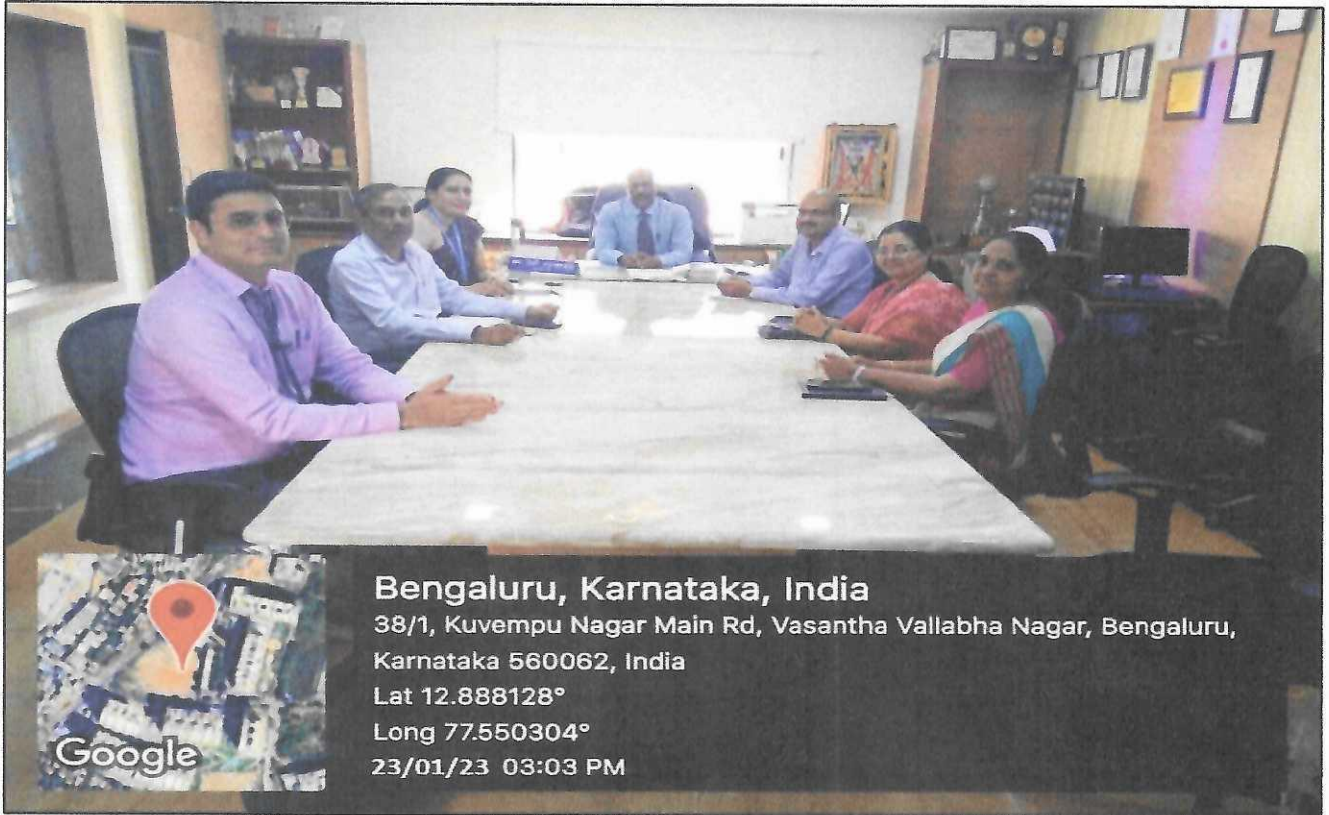
Fig 1: IQAC Meeting Held on 23 th January 2023