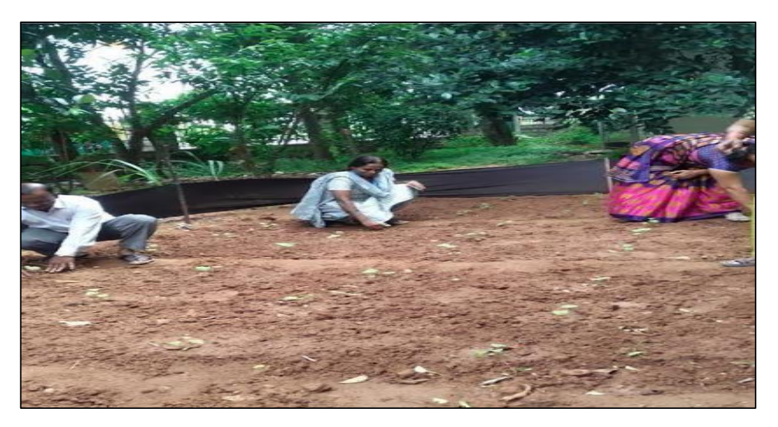
Fig 1: Non-teaching staff sapling the plants