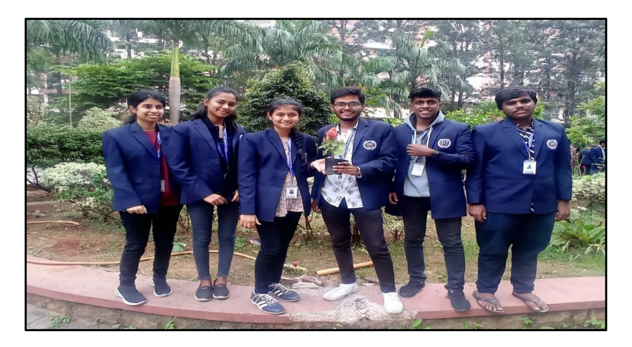
Fig 2: Highlights of the Environment Day celebration