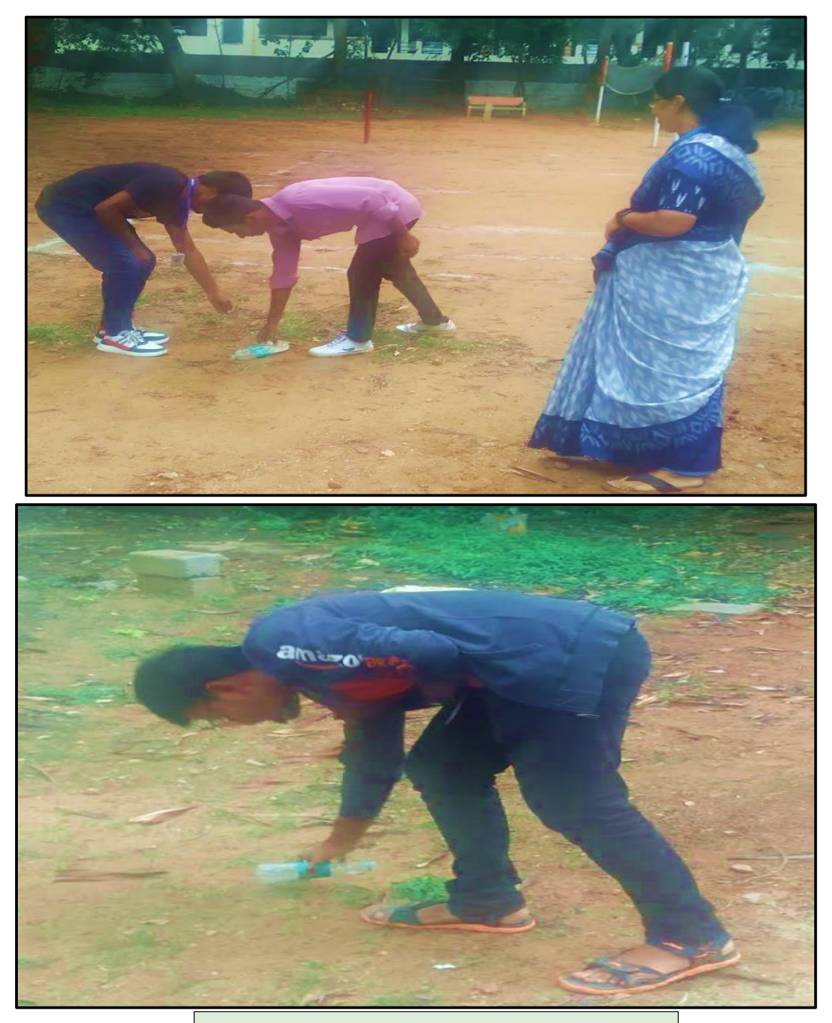
Fig 1: Highlights of the Activity