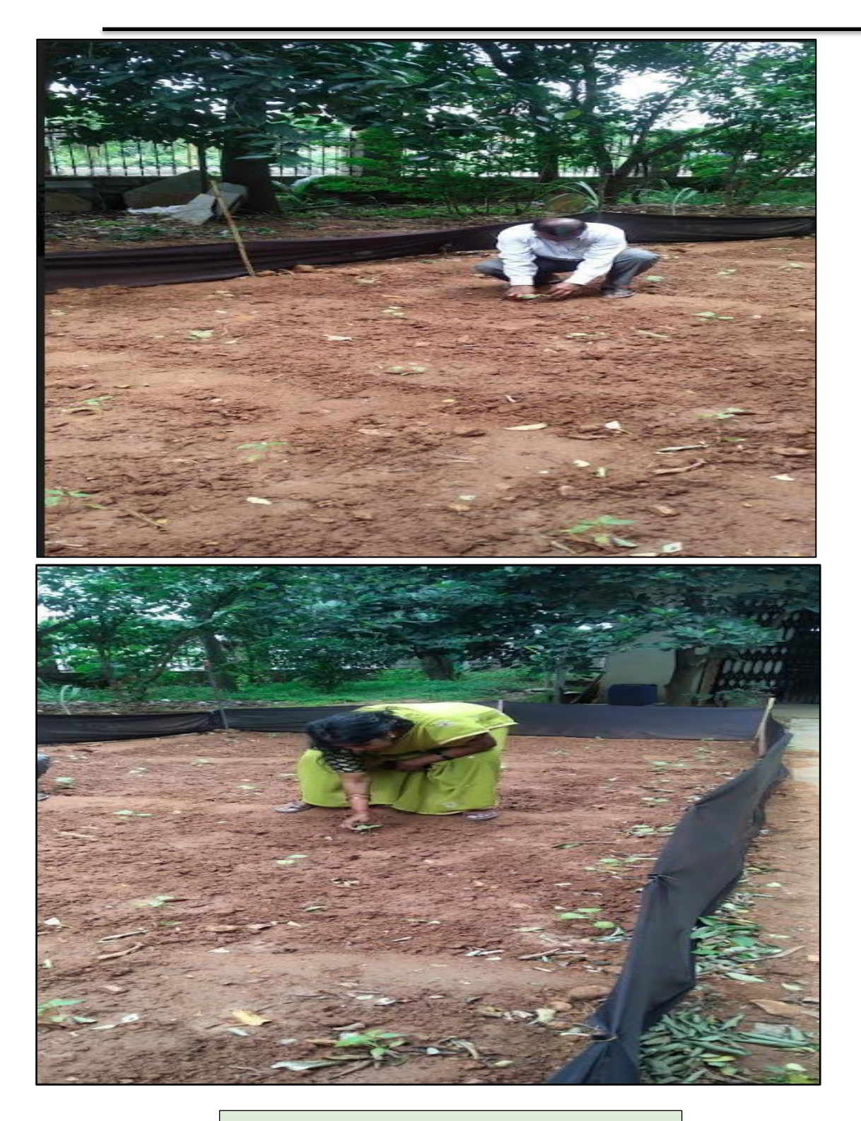
Fig 2 : Highlights of Organic Farming