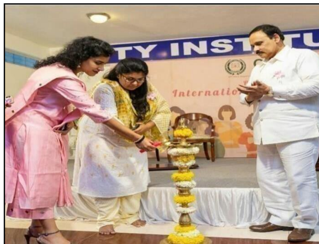
Fig 1: Lighting of lamp by chief guest