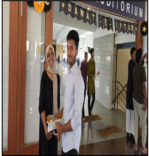
FIG 1: Glimpses of Ramadan Celebration