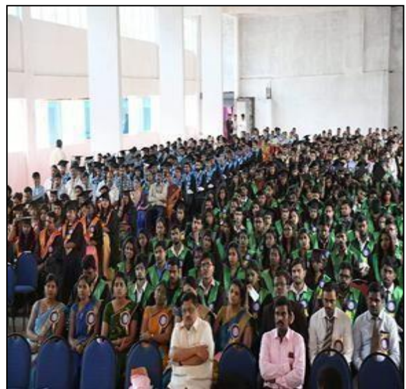
FIG 1: Glimpses of Graduation Day