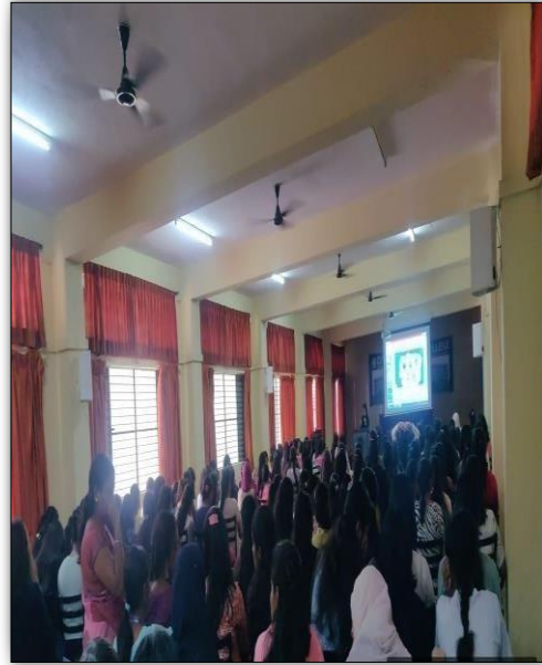
FIG 1: Highlights of the session