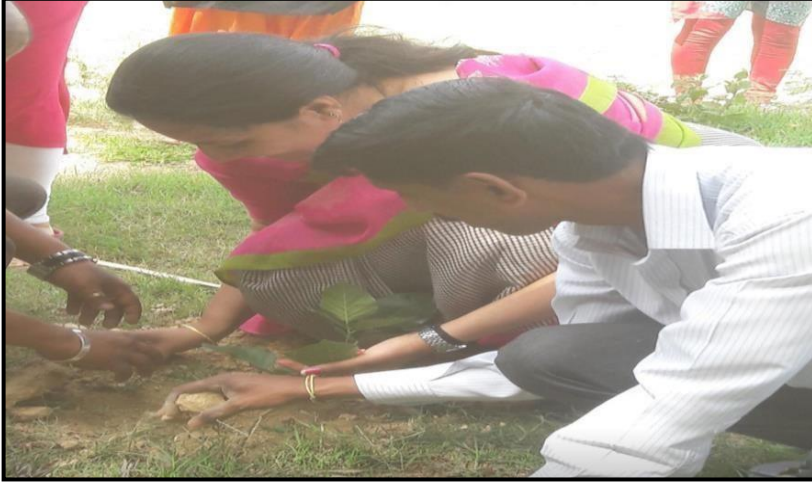
FIG 1: Glimpse of World Environment Day celebration