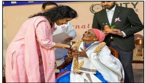
Fig 2: Felicitation for teaching and non-teaching Staff