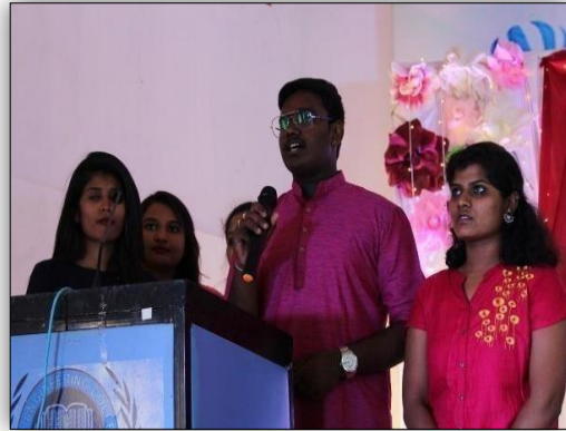
FIG 3: Glimpses of performance by students