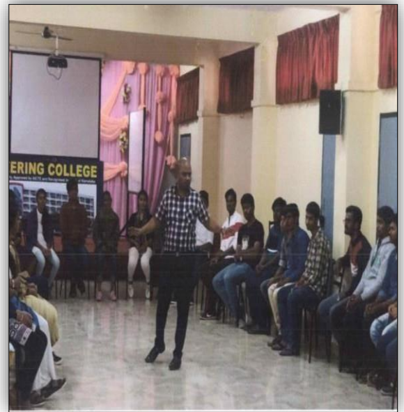
FIG 1: Orientation session highlights