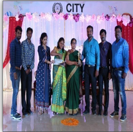
FIG 4: Release of Magazine