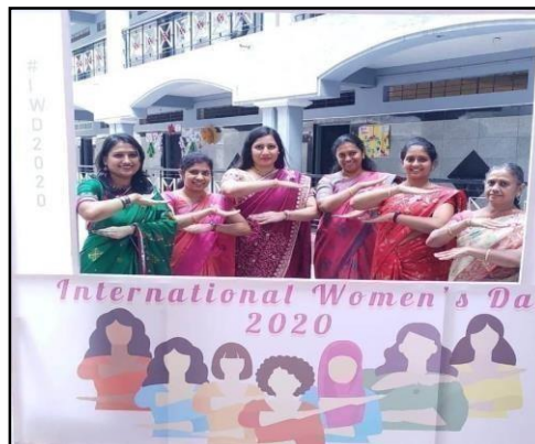
Fig 3 : Glimpses of Women's Day celebration