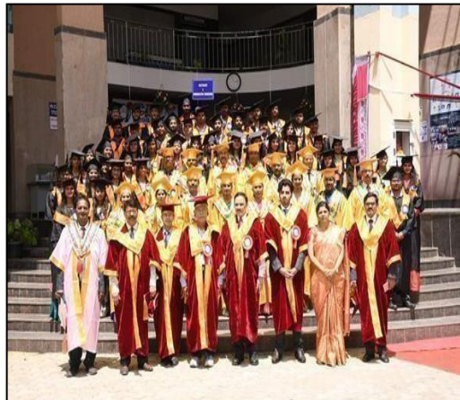
FIG 2: Department wise group photos