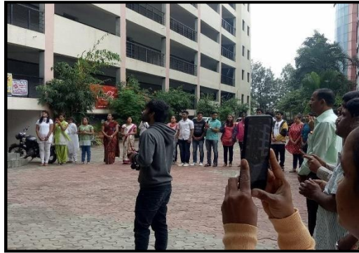
FIG 1: Glimpses of Independence Day celebration