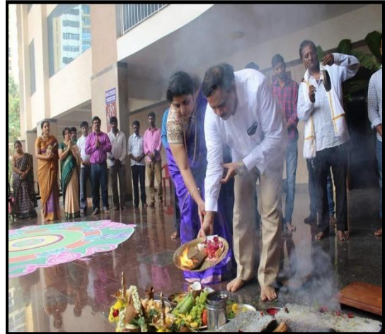
FIG 1: Ganesh festival celebration