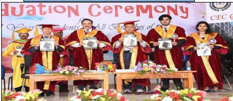
FIG 3: Graduation day magazine release