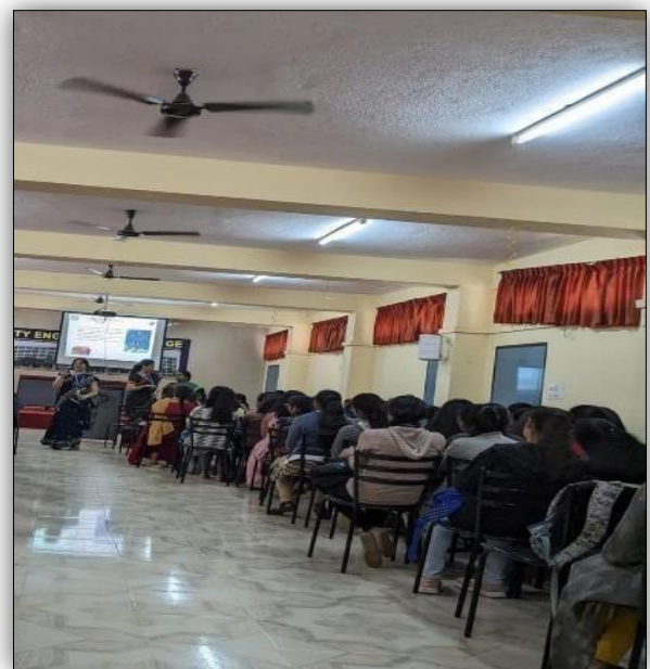
FIG 1: Session on Gender Sensitization