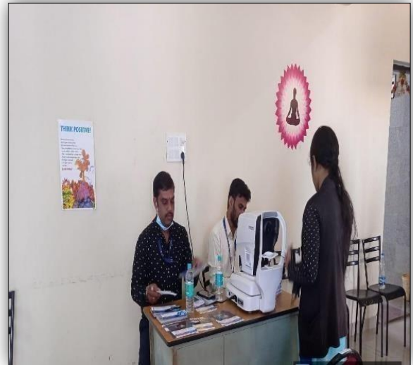
FIG 1 : Glimpses of Health check up