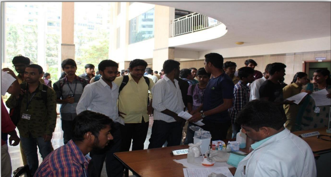
FIG 2: Preliminary check up before blood donation