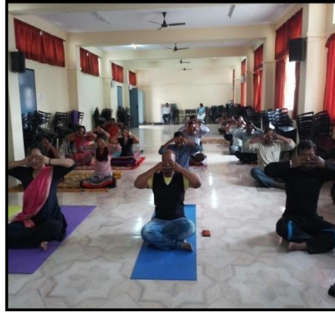
FIG 1: International Yoga Day meditation session