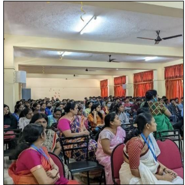
FIG 1: Glimpses of the session