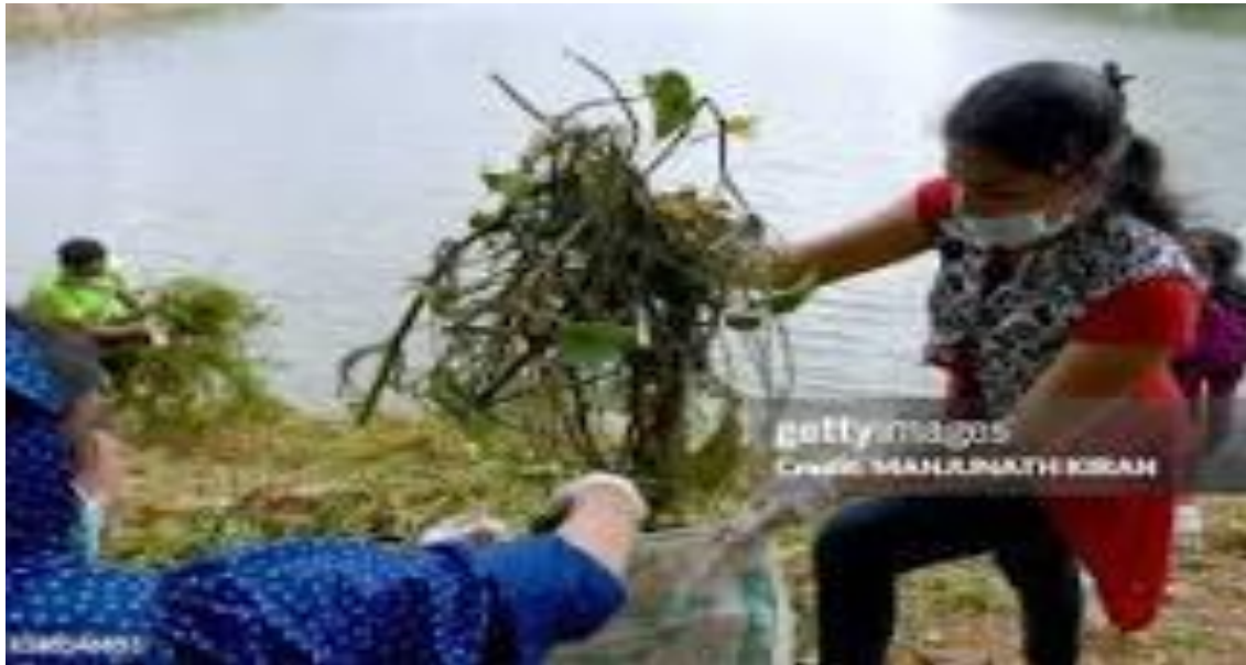
Fig 1: Glimpses of Jal Shakti abhiyan