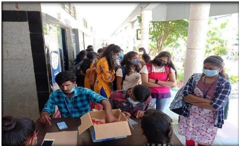
FIG 1: Glimpses of COVID - 19 Testing