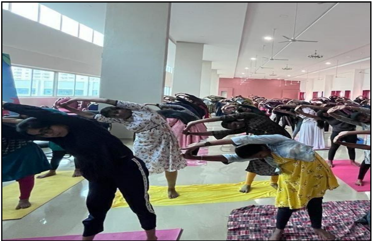
FIG 1. Glimpses of Yoga day for women