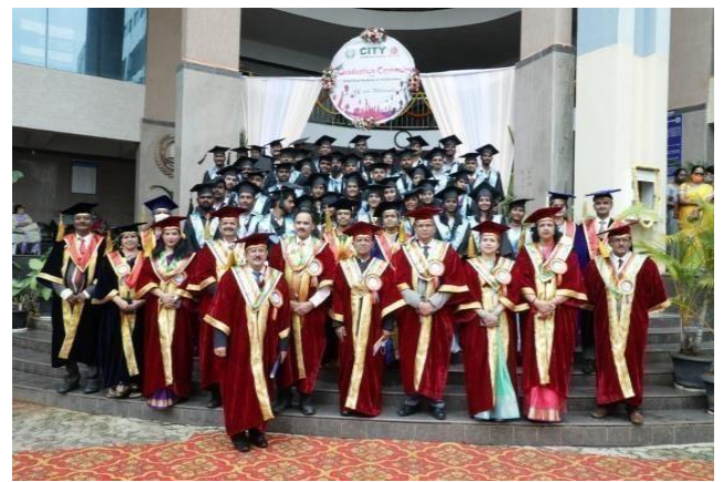
FIG 1: Glimpses of Graduation Day