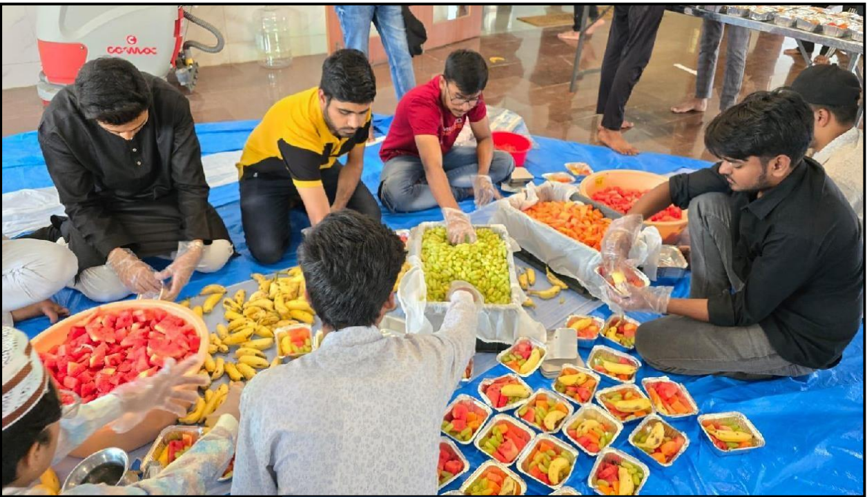
FIG 1: Glimpses of Ramadan Celebration