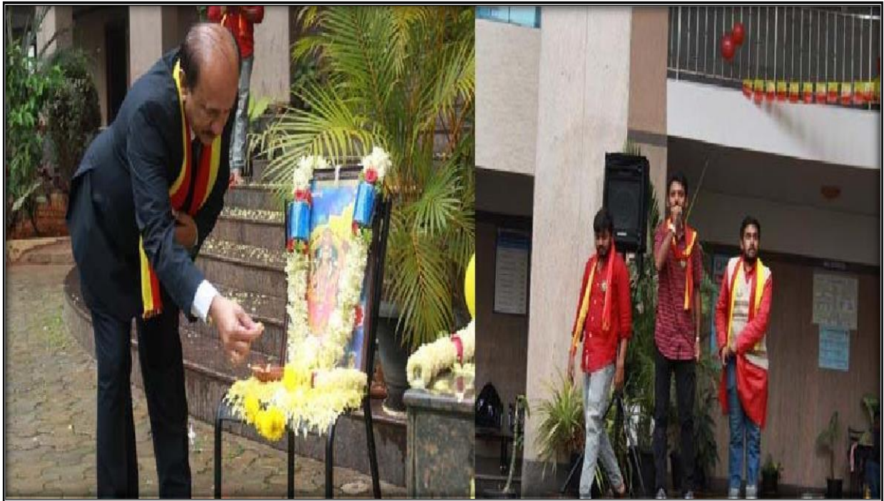
FIG 1. Lighting the Lamp by Principal

We heartily express our thanks toward the head of the institute for his kind and cooperative support all the time for the success of the event.