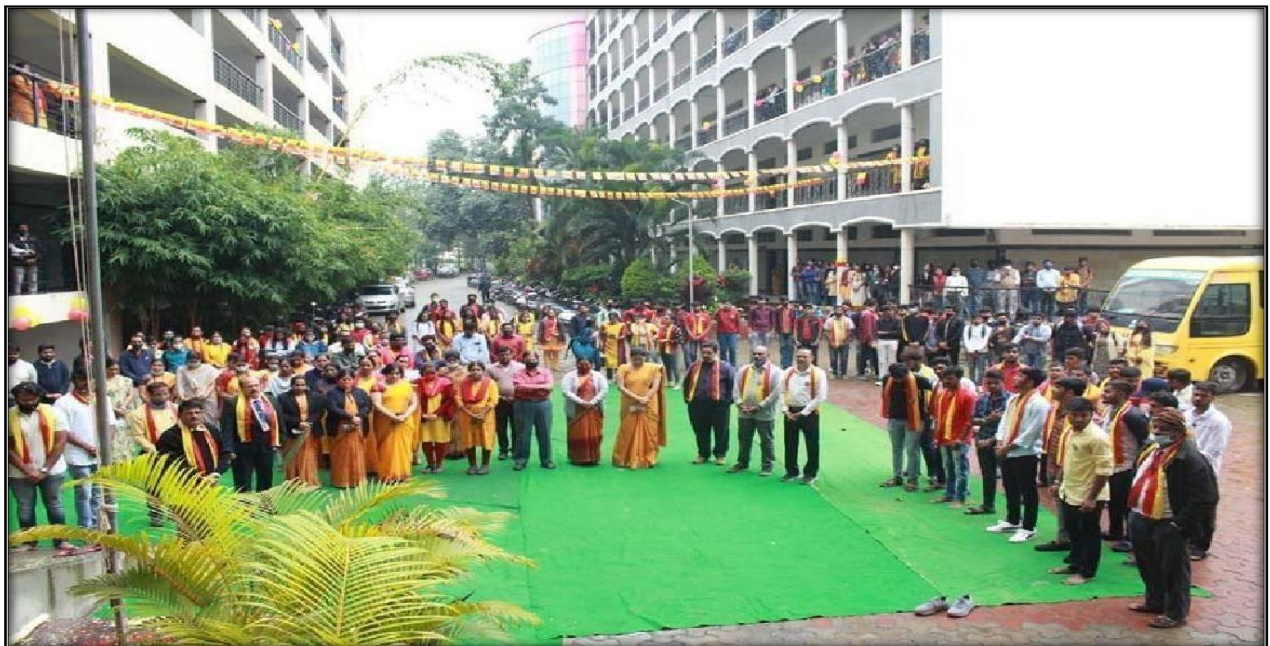
FIG 3: All Staff and Students participated in kannada Rajyothsava function