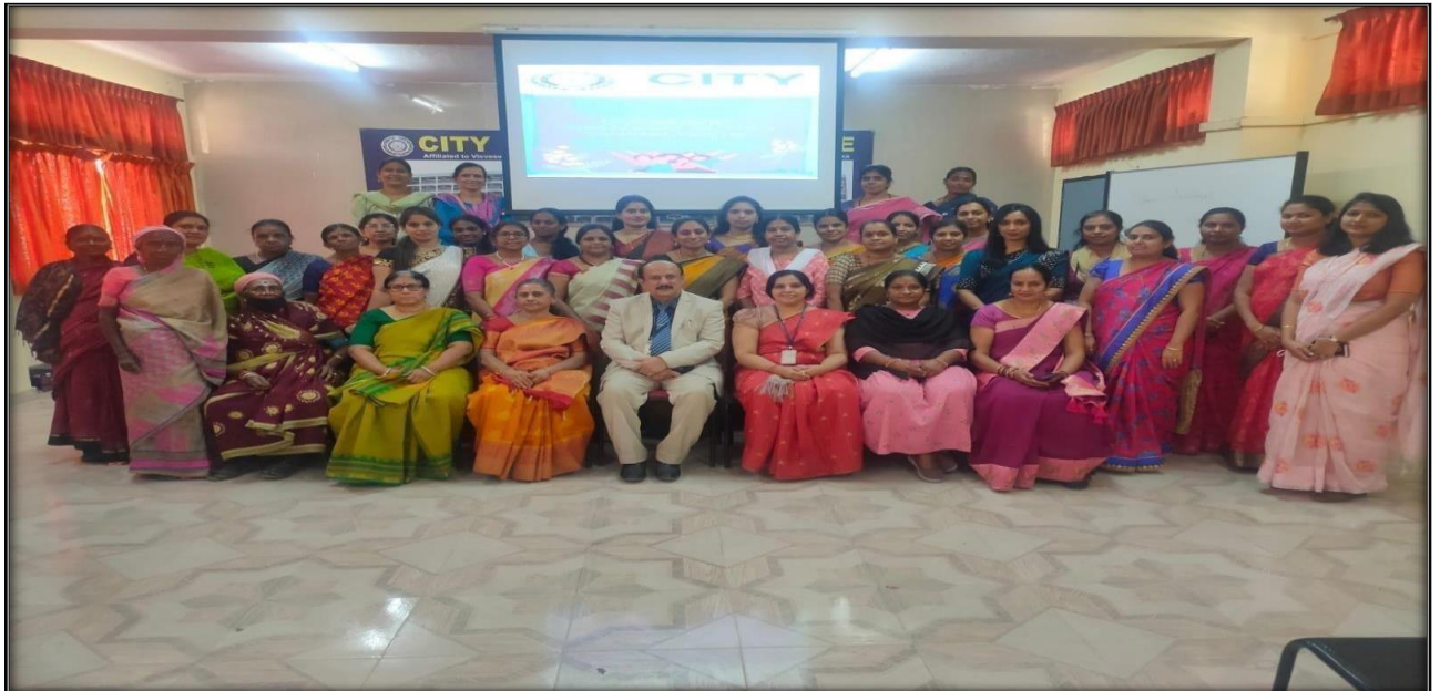
Fig 1: Glimpses of women's day