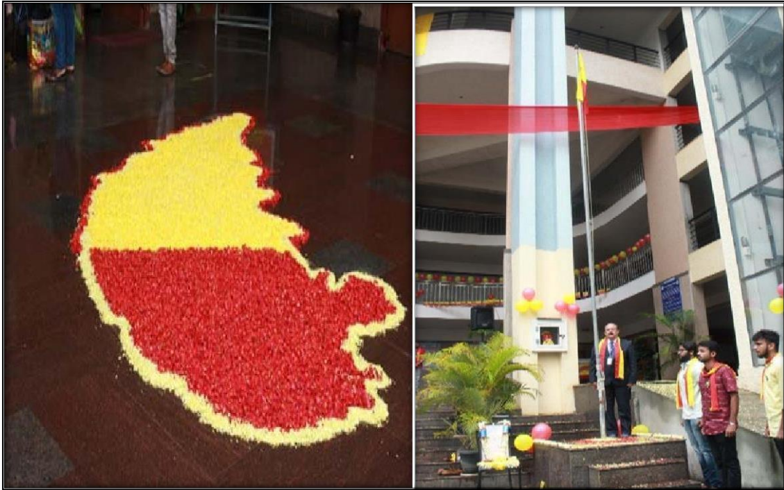
FIG 2. Flag Hoisting by Principal