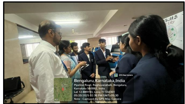
6. English Language-Its Role in Employability on 07/04/2025 to 12/04/2025